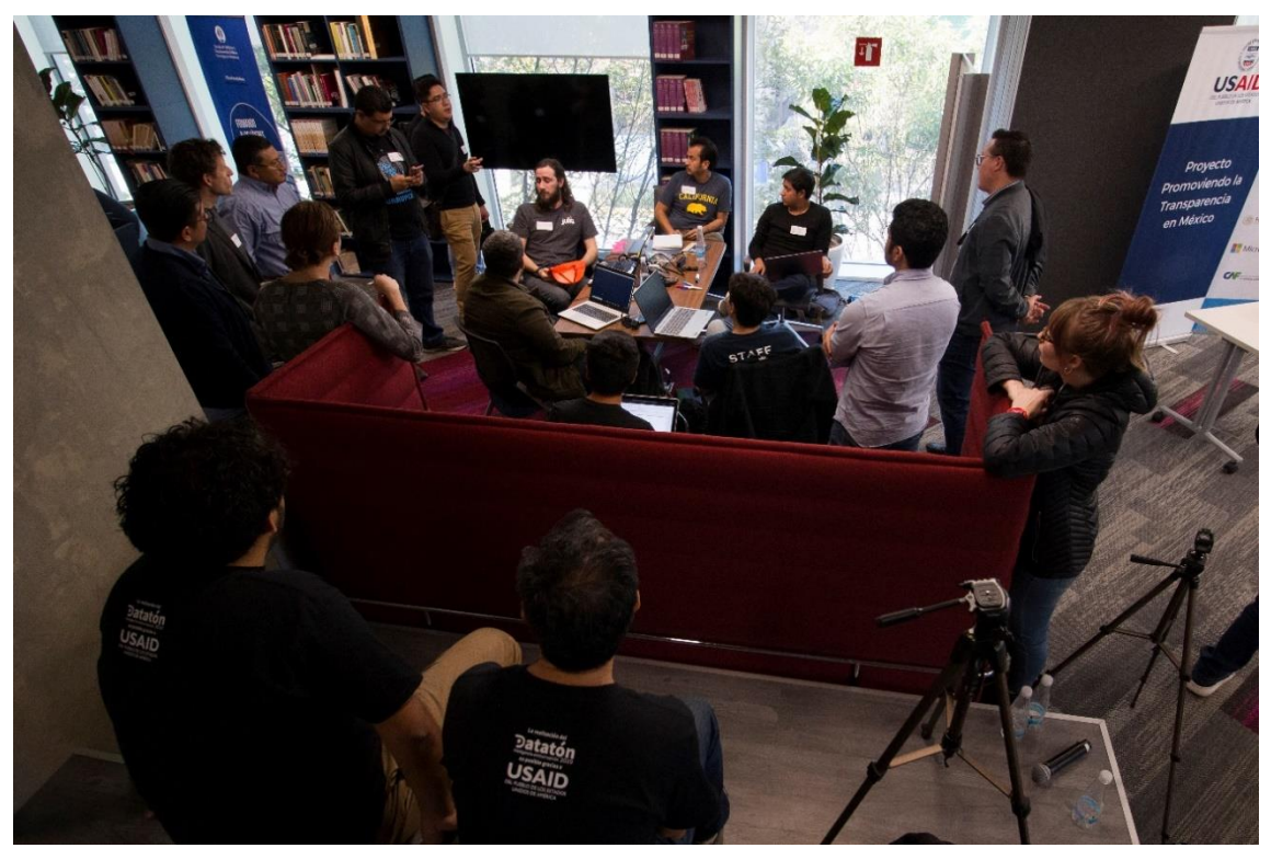
Supported through USAID's Transparency Rapid Response Project, the Datathon event gathered Mexican data scientists, programmers, software developers and civil society members to analyze data from federal public contracts in Mexico with the objective of detecting corruption risks using different databases from the National Digital Platform.

Application to ROL. Though justice reform is often seen as a technocratic endeavor, interventions focused on delivering or building "best practices" have not generally created sustainable positive results. Rather, because justice is an ephemeral, highly personal concept and because the delivery of effective justice services necessarily implicates history, culture, and identity, ROL and justice reform is thus always an iterative process. In essence, justice reform must be iterative and adaptive in part because the idea of "justice" is almost always dependent on individual values and visible politics. As a result, only "best fit" approaches are likely to work, and the "fit" is not apparent at project inception, USAID ROL reform programs regularly employ CLA principles.