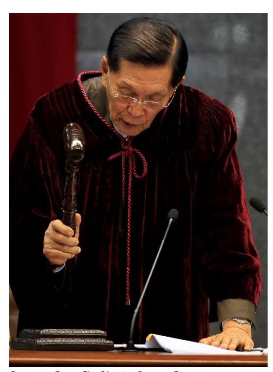
Supreme Court Chief Justice Renato Corona was impeached in the Senate trial as part of an anti-corruption drive by President Benigno Aquino in Manila.

The second step of the ROL Framework's four-step assessment process is to "understand the roles of major players and their commitment to reform" which can be done through TWP PEA. Because ROL institutions directly administer decisions that uphold the power structure of a state and govern the state's monopoly on the use of force, the ability to fully grasp and consider the interests of key actors and the dynamics of relationships and power when undertaking ROL programming is significant. Commitment to reform is likely to vary across the many stakeholders in the justice system, e.g. Ministries of Justice, courts, prosecutors, legal aid offices, law enforcement. A ROL program's path forward will reflect the priorities of those who wield and are in power in partner countries, and whether their concerns are evident or not, a ROL program's success depends on their political acceptance.