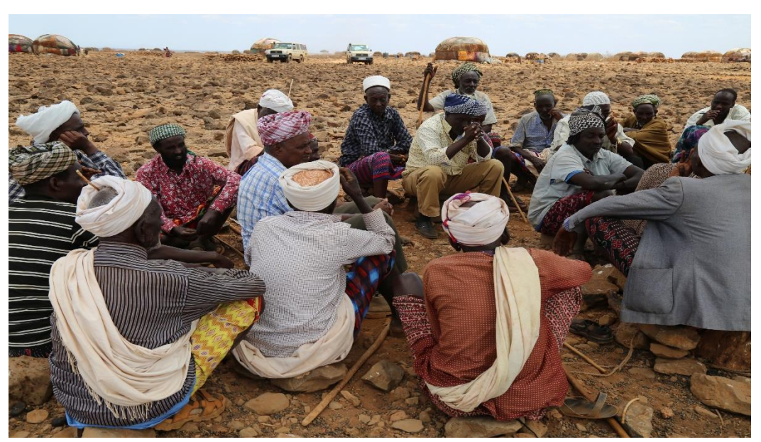
Gabra community clan elders holding a community dialogue on women's rights.