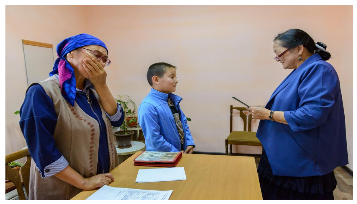
Avaz received a birth certificate at a USAID-supported Free Legal Aid Center in Kyrgyzstan.

health service delivery. Likewise, capable and independent criminal justice systems are vital to preventing the influx of counterfeit medicines.