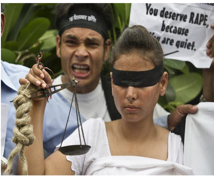
Protest outside the Saket Court Complex for fatal gang rape of student on a New Delhi bus.

Each of these individuals is vulnerable to exploitation and/or abuse as well as unable to access the economic opportunities and