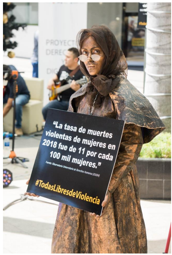
Event to raise awareness of violence experienced by women in El Salvador.

Because of the complexity of many justice concepts, direct measurements that accurately capture the facets of a concept are often too expensive, time-consuming, or difficult to collect. Instead, proxy indicators have proven more feasible for ROL programs — indicators that measure the reflection of a concept, rather than the direct measure itself. For example, measuring changes in citizens' trust in justice services for gender-based violence would require public opinion surveys, one of the more expensive and unwieldy of data collection methods. A proxy indicator could be the change in number of victims of genderbased violence who bring cases to state justice officials, adjusting for changes in frequency of occurrence of these acts. Another approach to measuring outcomes of complex justice concepts is to use a basket approach, where several indicators that each measure a different facet are combined to consider changes in that concept.