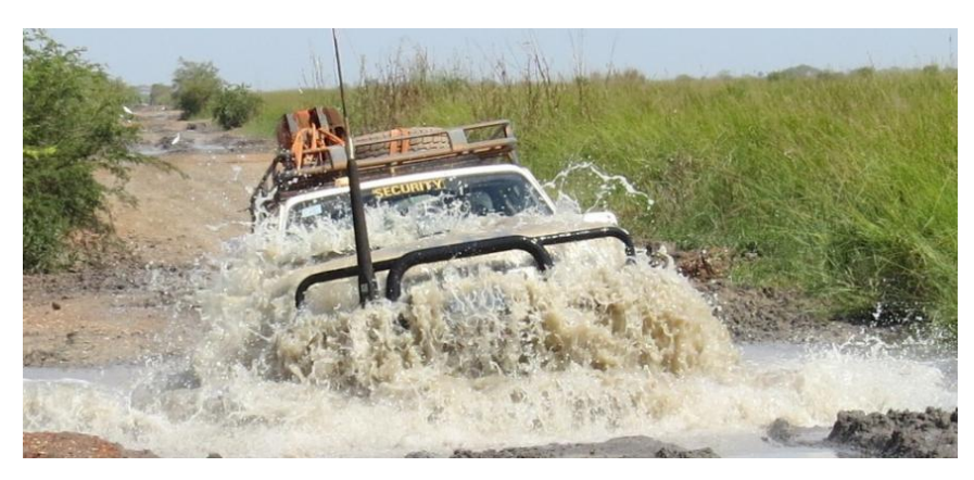
USAID/OFDA supports the work of UNDSS to increase humanitarian access and provide security training for humanitarian staff in complex environments.