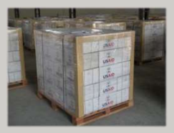
One set per family of 5.