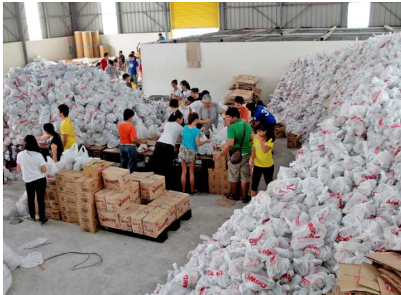
Food Distribution in the Philippines