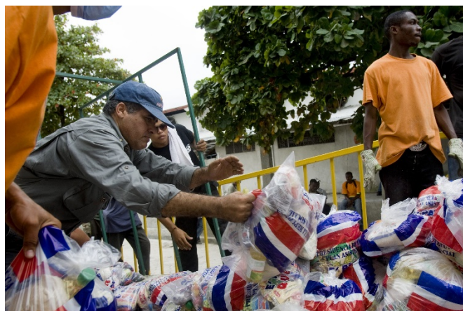
UNEP/OCHA JOINT ENVIRONMENT UNIT

The ways in which different types of assistance materials are packaged, transported, and stored significantly impacts the quantity and type of packaging needed. Consolidating and streamlining distribution can reduce transportation needs, improve warehousing efficiency, and ultimately reduce the quantity of packaging used. During consultations, stakeholders discussed opportunities for minimizing waste through the use of kits – which involve packaging various components of a set as one unit versus individual units – including shelter, kitchen, and hygiene kits. For instance, in 2012, ICRC removed the plastic bags that wrapped each individual item in kitchen sets and any plastic products, reducing the amount of plastic packaging kit. This saves about 53 metric tons per year. OFDA has implemented a similar practice. Shipping items in bulk is another opportunity to reduce waste. For some commodities, WFP ships supplies (e.g., cereals) in bulk and then packages at the port of discharge for distribution, with the objectives of reducing surplus packaging and ensuring recipients receive the appropriate amount of a given commodity. Additional examples can be found in Table 5.