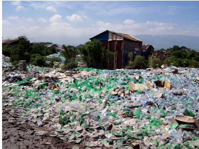
Plastic Waste in Haiti

Humanitarian assistance aims to save lives and alleviate suffering during and after emergencies and crises, as well as to strengthen preparedness. A key function of humanitarian assistance is the delivery of life-saving commodities and supplies to those seeking to survive and recover in post-disaster and post-conflict emergency settings. According to the 2020 Global Humanitarian Outlook produced by the United Nations Office for the Coordination of Humanitarian Affairs (UN-OCHA), nearly 167.6 million people will need humanitarian assistance in 2020, representing approximately one in 45 people worldwide. The UN and partner organizations aim to assist 109 million of these people in need, which will require funding of $28.8 billion (United Nations Office for the Coordination of Humanitarian Affairs (OCHA) 2019). The number of people in need of this assistance has tripled over the past decade. Further increases are expected due to the COVID-19 pandemic. Food insecurity could double at an additional cost of $6.7 billion.