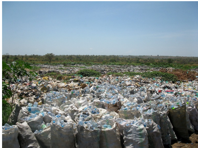
Plastic Bottles, IDP Camp in Haiti

Regulations that ban single use plastic or specific plastic items may cause stakeholders to rethink their procurement strategies in terms of where they source items and which items to procure and distribute. For example, plastic-related restrictions or bans in Kenya, Rwanda, and Tanzania that limit or eliminate the use, manufacture, and import of plastic films of a certain thickness (though more regulations may be forthcoming) have directly affected humanitarian assistance operations. Imports or deliveries that fail to meet stated requirements are rejected, and in some cases, organizations can no longer import products containing plastics (e.g., tarpaulins, jerry cans, and refugee housing units). A UNHCR emergency stockpile in Tanzania maintained for rapid response in the region was closed in part due to the new plastic-related import restrictions, and forced UNHCR to rethink its relief distribution strategy. See the WFP and UNEP report from 2018 for more examples (United Nations Environment Programme (UNEP) 2018).