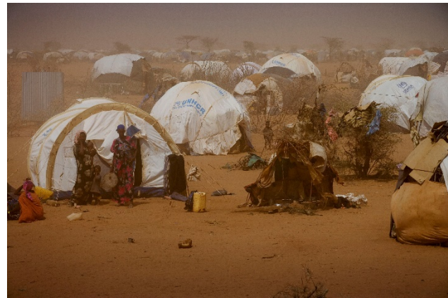
Somali women and children stand outside temporary tents provided by the Office of the United Nations High Commissioner for Refugees (UNHCR) in the Dagahaley refugee camp in North Eastern Province, near the Kenya-Somalia border. Clothing and other items hang on small trees near several makeshift tents. The camp is among three that comprise the Dadaab camps, located near the town of Dadaab in Garissa District.

Packaging for non-food assistance must also minimize loss by ensuring the items get to aid recipients intact through the transportation and distribution chains. Some non-food items can be toxic, such as pesticides, meaning their packaging may require different management processes than typical solid waste.