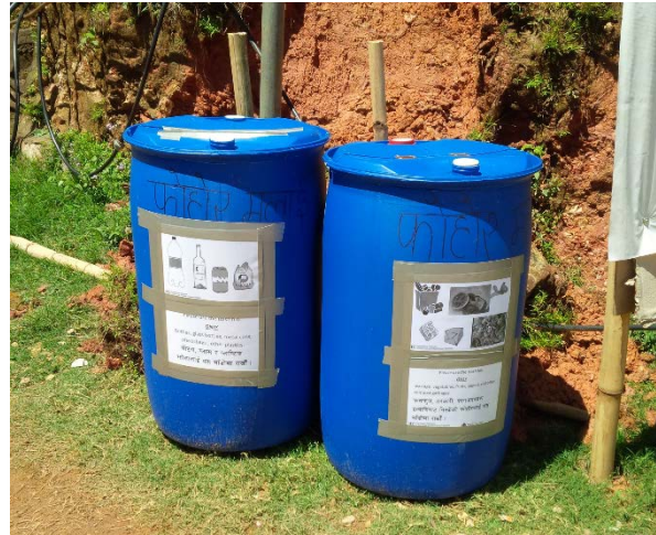
Recycling Waste in Nepal

End-of-life management practices might be most easily applied in contexts where private sector and humanitarian stakeholders have a proximate or overlapping presence. For example, in South East Asia, many companies have undertaken significant plastics recycling efforts, and there are substantial ongoing humanitarian nutritional support and disaster risk reduction activities. However, numerous small-scale recycling schemes outside of the humanitarian community are also taking place in many assistance-receiving countries in response to the broader waste crisis. Such smaller schemes include recycling plastic bags and other plastic items into, for example, bricks for construction and hose pipes for irrigation. One company consulted introduced briquettes made of compressed cardboard and shredded PP bags to alleviate issues of fuel scarcity and waste in refugee camp settings. In some instances, humanitarian stakeholders are partnering with local entrepreneurs. For example, in Uganda and Colombia, UNHCR, in coordination with local entrepreneurs, is looking into small-scale refugee housing and WASH solutions with recycled materials.