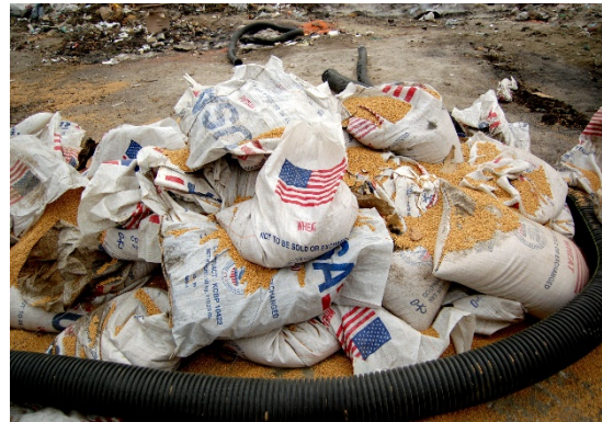
Food Waste in Afghanistan UNEP/OCHA JOINT ENVIRONMENT UNIT

Food assistance refers to both in-kind food commodities (i.e., food aid) and market-based activities, such as locally procured commodities or cash, that contribute to food security. Food assistance is mobilized in response to emergencies and crises where there is an identified need and local authorities lack the capacity to respond. Food assistance is used to save lives, reduce suffering, and support the early recovery of people affected by armed conflict, natural and man-made disasters. Food materials include oil, flour, grains, cereals and pulses, canned food, therapeutic foods, fortified foods, or nutrient supplements that provide life-saving support.