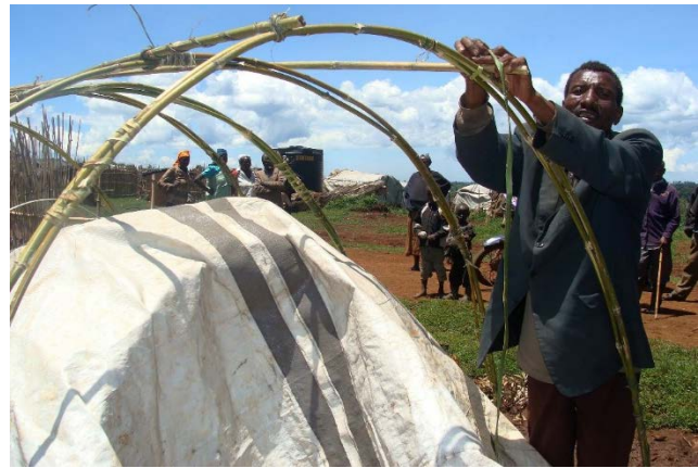
Internally Displaced Person (IDP) Camp in Kenya