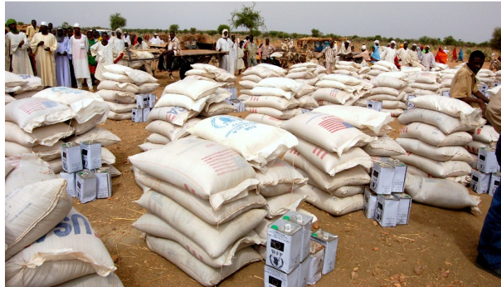
Food Packaging, Sudan