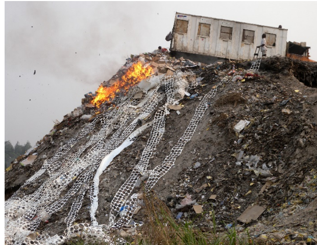
Burning Waste in DRC UNEP

This section outlined the context of packaging waste management in humanitarian supply chains, including current efforts to improve packaging waste management and associated challenges. Understanding the context of packaging waste within the humanitarian assistance sector and applying a circular economy framework helped identify the most prominent and urgent challenges and explore potential methods of intervention. These methods of intervention are explained in detail in the following section.