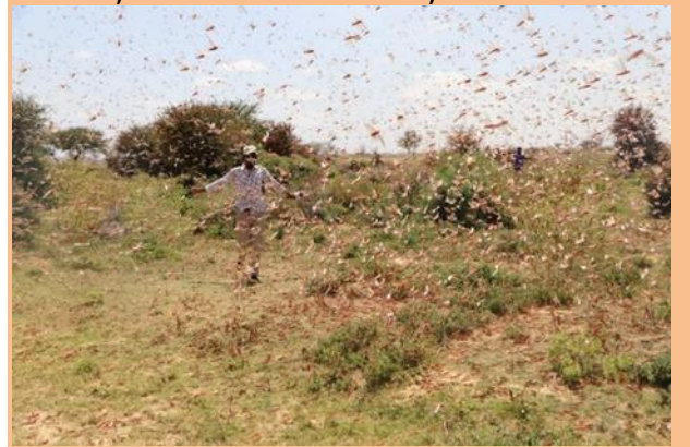
Immature swarm in northeastern Somalia

hoppers in the Horn of Africa and Yemen, however, the situation remains worrisome. Substantial hatching and hopper formations caused numerous immature swarms to form in northeast Ethiopia , and 57,457 ha were treated. Hopper bands and swarms continued to form in Yemen , and some swarms started to move to the southern coast, control operations treated 5,828 ha. An increasing number of swarms were reported in northern Somalia and control operations treated 17,477 ha. In Saudi Arabia, control treated 13,745 ha.