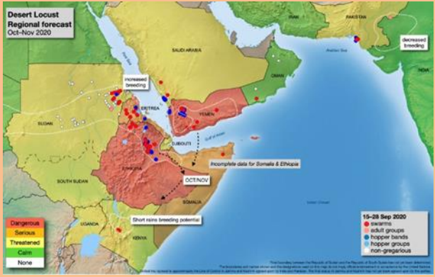
SGR situation for August October-November 9/2020, FAO-DLIS)

With the trade winds coming from the north becoming established over the Horn of Africa, there will is an increased threat of swarm migration from Yemen, northeast Ethiopia and northern Somalia south to eastern Ethiopia and central Somalia in October that could extend to northern Kenya in November. Winter breeding that began earlier than usual along the Red Sea coast, an extra generation of breeding is likely this season and could substantially increases locust numbers in the region. Unless control operations are intensified aggressively in the region in the coming weeks and months to prevent the repeat of the 2019 massive invasions and outbreaks (DLCO-EA,