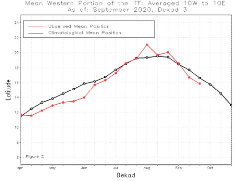
Figure 2 – Latitude value of ITF position in the western region (NOAA, 10/2020)