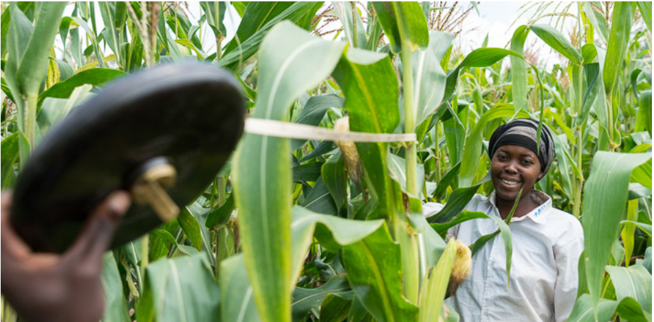
GLOBAL COMMUNITIES Measuring success: In Rwanda, cooperative members are measuring maize crops to ensure a bountiful harvest

The Cooperative Development Program (CDP) is a global initiative that strengthens cooperative businesses and credit unions across multiple sectors throughout Africa, Asia, and Latin America. The program partners with U.S.-based cooperatives and Cooperative Development Organizations (CDOs) for five-year activities.