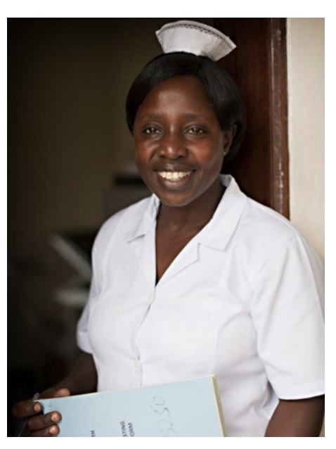
HEALTHPARTNERS Cooperating for health: A nurse working at a health cooperative in southwestern Uganda