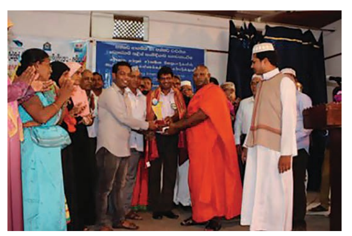
Celebration of diversity and unity with local religious leaders

DIRCs provided a common platform for leaders of all religions in a community to come together, discuss, and share cultural values in order to improve communication between different groups. Their collective purpose of resolving points of tension unified these groups in their role as peace-keepers within their communities.