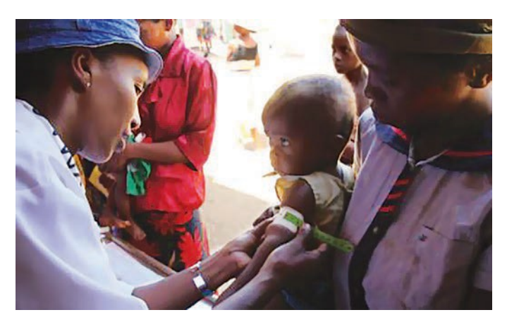
A community health worker screening children for malnutrition

Partnerships with religious and community leaders were key to ASOTRY's success. ADRA has witnessed the impact these individuals have in improving lives. Engaging religious and community leaders in development and humanitarian assistance leads to effective and sustainable changes in social and community resilience.