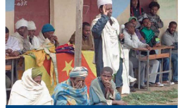
A priest gives opening remarks on the declaration of an ODF zone

Ethiopia has seen progress in the sanitation and hygiene sector during the past ten years, much of it achieved through the Government's Health Extension Program. As part of the project, Food for the Hungry (FH) engaged local religious and community leaders to help sensitize and construct public latrines for the declaration of 'Open Defecation Free' (ODF) zones. For example, Food for the Hungry (FH) worked with Orthodox Church priests to reach out to their congregations on the importance of sanitation and