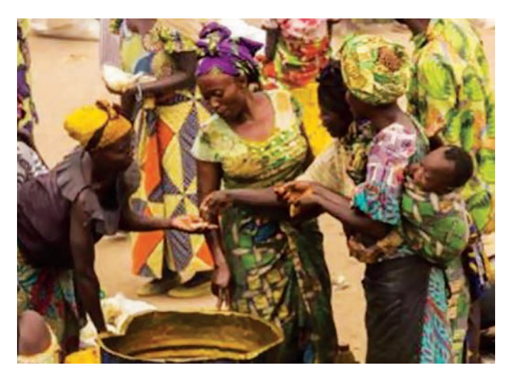
Samaritan's Purse Livestock Training and Support in Eastern DRC

This modality was preferred, as it empowers households, and particularly women, to choose and purchase the items they need most.