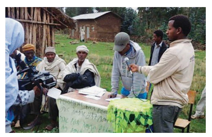
A Kebele (ward) leader declares an ODF zone with local religious leaders to his right

This project used the care group approach where volunteers delivered health and nutrition messages, enabling the project to reach a large part of the community. Multi-media outreach tools—such as mobile cinema, image box, participatory theater, and comic books—helped influence behavior change as well.