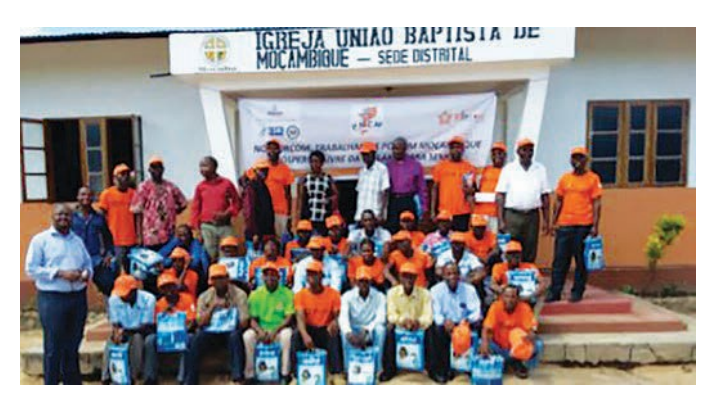
PIRCOM trainees outside a church building after training

Religious leaders are deeply engaged with their communities, so community members trust their messages about malaria prevention and treatment. Likewise, community health workers are key individuals in the community since they provide primary health care, particularly in rural areas. Additionally, churches are dispersed across the country, including in some of the most remote regions, which enabled the project to reach frequently under-served populations.