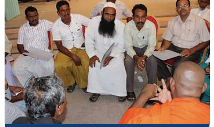
Members of a district inter-religious committee in discussion