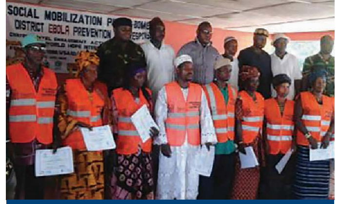
Cultural Liaisons Presentation and Certification at Gbendembu Ngowahun Chiefdom

The social mobilization work led to the design and implementation of the innovative Cultural Burial Liaison initiative. The initiative was co-designed by Paramount Chiefs, Sierra Leone's traditional leaders and cultural societal heads, to ensure the burial practices honored religious tradition.