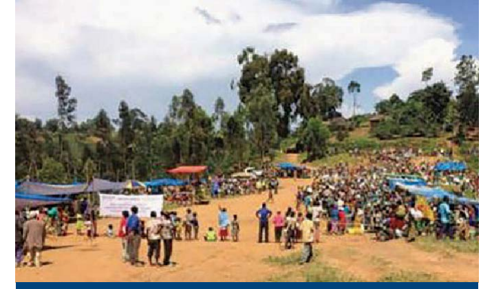
Samaritan's Purse Voucher Fair in Eastern DRC

Provision of food and non-food items was conducted through a combination of direct distributions and voucher fairs. Items were directly distributed in areas with high levels of insecurity and/or poor infrastructure that resulted in limited market access. Cash-based voucher fairs were utilized in areas with secure, accessible, and integrated markets. Local vendors gathered at voucher fair sites, providing locally preferred produce and non-food items to beneficiaries.