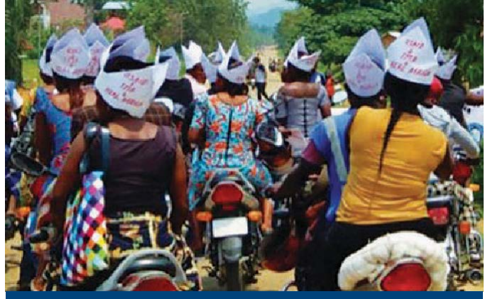
Community-based campaign to increase awareness of gender-based violence

The project has assisted 30,033 people with recovery from SGBV through psychosocial support. Confidential one-on-one counseling by communitybased lay counselors is the cornerstone of Ushindi's psychosocial services. Legal services were made available to 14,112 survivors. This counseling was provided by lawyers in legal clinics set up at safe houses. 16,193 SGBV survivors and their partners were reached with affordable and appropriate medical services, including post-exposure prophylaxis (PEP) kits for HIV/AIDS, prevention and treatment of sexually transmitted infections, emergency contraception, treatment of fistulas, and treatment of vaginal prolapse. Village savings and loans associations (VSLAs) were set