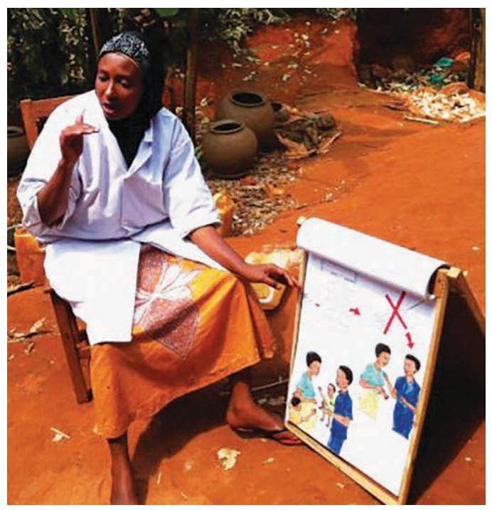
Celebration of diversity and unity with local religious leaders