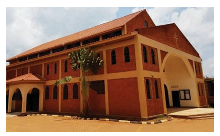
St. Apollo church in Kampala, Uganda

Faith communities may benefit from having full information about the available methods of family planning and should be free to decide what contraceptive method, if any, may be right for them. When they are in a comfortable environment with their peers, religious leaders are very open to discussing family planning and learning about its potential benefits. Religious and community leaders' knowledge about family planning can be increased through training sessions and realistic simulation exercises.