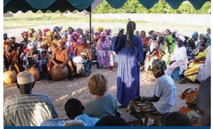
A local Imam encourages his community to practice healthy timing and spacing of pregnancies

3) Resource Mobilization—Training of health workers in family planning counseling and services was a main focus. MOH staff provided condoms, pills, and intrauterine devices (IUDs) at Health Huts for no extra cost to users while nurses trained village health committees on the benefits of HTSP.