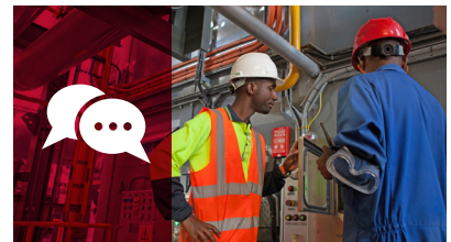
UNCOMMON CAMERA FOR USAID

USAID holds all recipients of U.S. development assistance accountable for results by insisting on government investment, planning and capacity building.