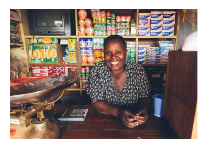
Private enterprise is the single most powerful force for lifting lives, strengthening communities, and accelerating self-reliance.

At the same time, emerging markets have become increasingly attractive to private businesses and investors as places to sell their products, invest their money, and do business. Enterprise-driven development means aligning with the private