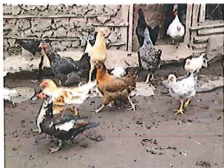
Poultry is a critical and neglected source of protein in Africa that USAID is improving via genomics tools

Curing Poultry Diseases - Livestock provides an important source of high quality protein and micronutrients, as well as extra income, to smallholder farmers in developing countries. To increase