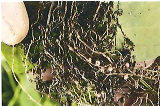
Legumes have a unique ability to increase soil fertility by converting atmospheric nitrogen to soil nitrogen through the use of "nodules" on the root system.

Sharing US expertise in soybean production - Improving legume productivity is a key element of the Feed the Future research strategy. Legumes play an important role in improving human nutrition, as well as contributing to farming system sustainability and soil health through their capacity to fix