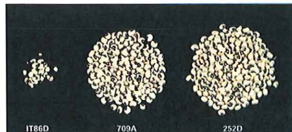
Cowpea production per plant of a non-GE variety (IT86D) and two GE varieties (709A and 252D) in Burkina Faso under insect pressure

Helping Bring Insect Resistance to Africa - The introduction of genetically engineered insect resistance into field crops in the U.S. has allowed farmers to significantly reduce insecticide use while maintaining robust yield levels, and has facilitated the introduction of low- or no-tillage agricultural systems that improve soil health. USAID is partnering with the Nairobi-based African Agricultural Technology Foundation (AATF), the Bill & Melinda Gates Foundation, and Monsanto to bring these insect resistance genes to two African staple foods, tropical corn and cowpea (or black-eyed pea). In the case of cowpea, the insect resistance gene has been shown to increase yields more than ten-fold when