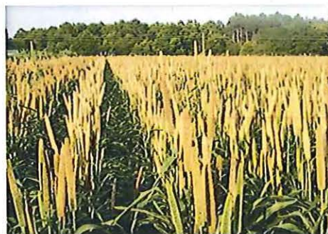
For 30 years, the University of Nebraska, Lincoln led USAID’s efforts to marshal the best US sorghum researchers to contribute to food security for the world’s most vulnerable

Improving the resilience of the “camel of cereals” - Sorghum is a critical food security crop across the Sahel and in the Horn of Africa. Known as the “camel of cereals,” sorghum can be grown in hot, dry environments, providing grain for human sustenance and forage for livestock. USAID has a thirty-year history of investing in sorghum research, first through the International Sorghum and Millet (INTSORMIL) program at the University of Nebraska-Lincoln, and more recently through USAID’s brand-new Feed the Future Sorghum & Millet Innovation Lab based at Kansas State University. INTSORMIL collaborators developed many higher-yielding varieties of sorghum combined with crop management approaches to reduce pests and diseases. A breakthrough developed by Purdue University faculty members participating in INTSORMIL, including World Food Prize Laureate Dr. Gebisa Ejeta, effectively controlled Striga, a parasitic weed that can decimate sorghum fields, particularly in Ethiopia. The Feed the Future Sorghum & Millet Innovation Lab is building on