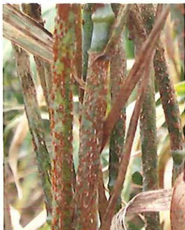
Research to control the wheat disease known as stem rust during 1961-2009 has added 6.2 million tons annually to world wheat harvests, worth US $1.12 billion per year

For African farmers to achieve food security and earn a profit from their farming activities as small businesses depends, in part, on their ability to optimize the amount and quality of food they produce on their land. However, African farmers often cannot access the improved inputs used by growers in the developed world. As a result, their productivity is consistently threatened on a yearly basis by many factors, including environmental stresses, such as drought and heat, and biological stresses, such as insects and diseases. For example, plant diseases of major food crops (including wheat, rice, maize, potato, soybean and cassava) account for up to 40% of pre-harvest losses and in some cases can reduce yields by 100%. Some of these plant diseases represent global threats: 90% of the world's wheat