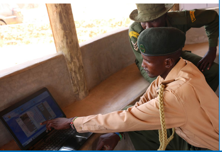
KENYA: Nasuulu Conservancy rangers use the GPS technology to track poaching cases.

In Kenya, the Northern Rangelands Trust used a community conservancy approach to help communities reinvigorate traditional management systems, rehabilitate degraded areas and improve regional peace and security. The program created and supported ranger units that helped rangers to address crime and threats against wildlife populations and to expand law enforcement in the conservancy areas. The Northern Rangelands Trust documented a 46 percent reduction in elephant poaching in fiscal year 2015 compared to poaching levels in the same area between 2012 to 2013.