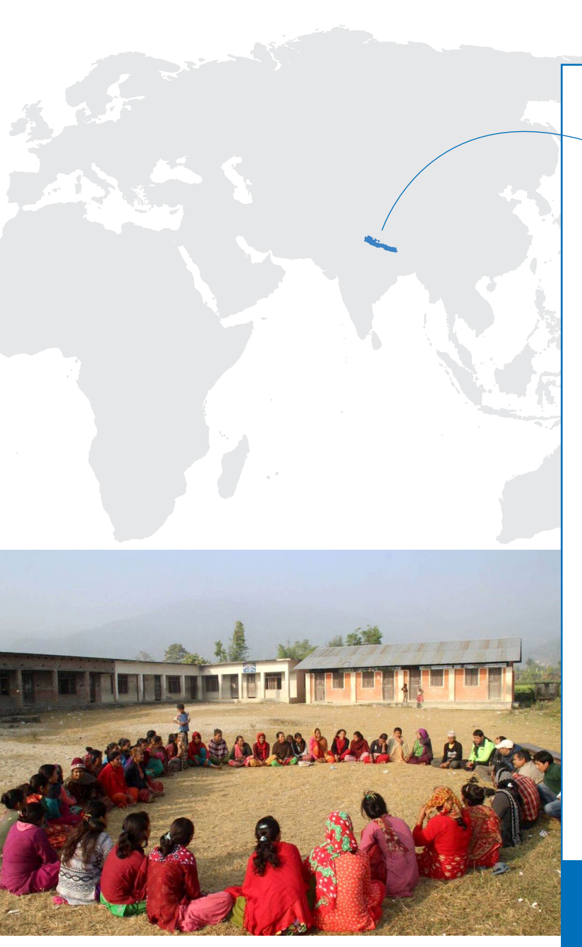
KANCHANPUR DISTRICT, NEPAL – 2012: The Hariyo Ban Program started a Community Learning and Action Centre.