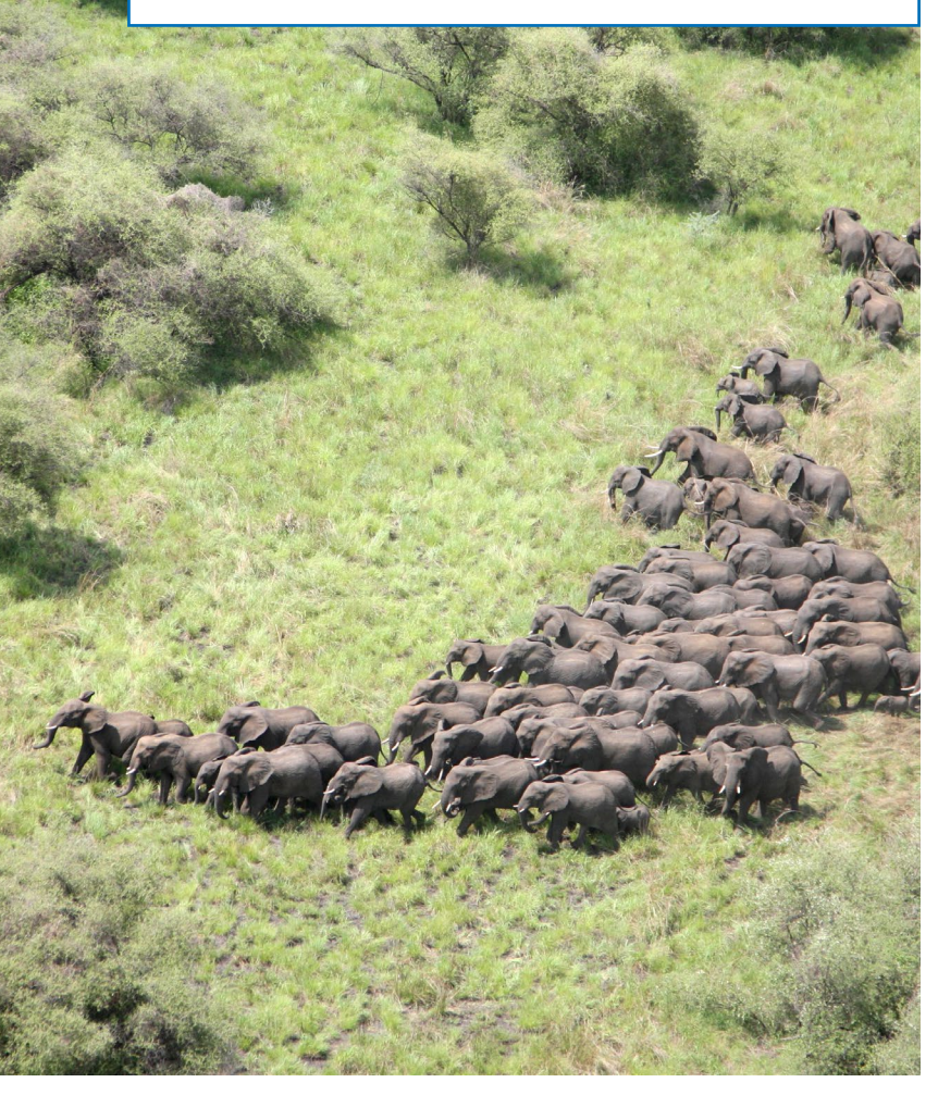
BOMA-JONGLEI LANDSCAPE, SOUTH SUDAN: Elephant herd.

The Boma-Jonglei Landscape of Southern Sudan program recognized that competition over access to and use of land and natural resources contributes to conflicts in the landscape and therefore focused on land use and security. The program supported the development of national level policy and legal frameworks, strategies and guidelines and strengthened the capacity of park authorities and local communities to manage parks, monitor wildlife crimes and manage conflicts. The Boma-Jonglei Landscape program provides a learning experience for other programs operating in post-conflict situations characterized by weak government capacity for law enforcement regulation and policy implementation.