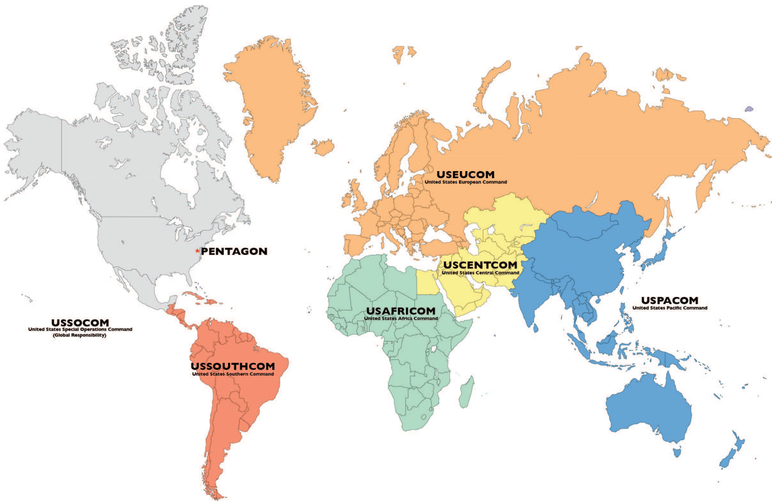
Map of USAID-DoD Current Strategic Liaison Relationships