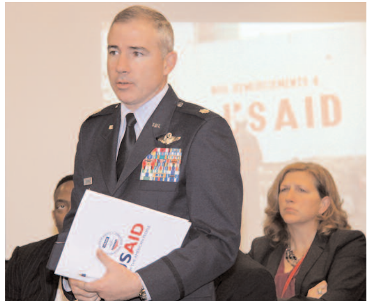
A U.S. Air Force student from the National War College asks a question at a USAID briefing in Washington, D.C., January 11, 2013. USAID sends students and faculty to several U.S. military schools and institutions each year, and routinely hosts briefings for members of the military to ensure transparency and mutual understanding.

USAID is the lead development agency of the U.S. Government (USG). The Agency offers a comparative advantage through its field presence and pool of skilled, experienced professionals. USAID contributes to national security objectives by addressing global challenges such as extreme poverty, food insecurity, poor governance, infectious disease, water scarcity, and climate change through strategic, sustained, and long-term development programs. When USAID succeeds in helping other countries address these challenges, the Agency may reduce security risks by preventing them from becoming crises and conflicts.