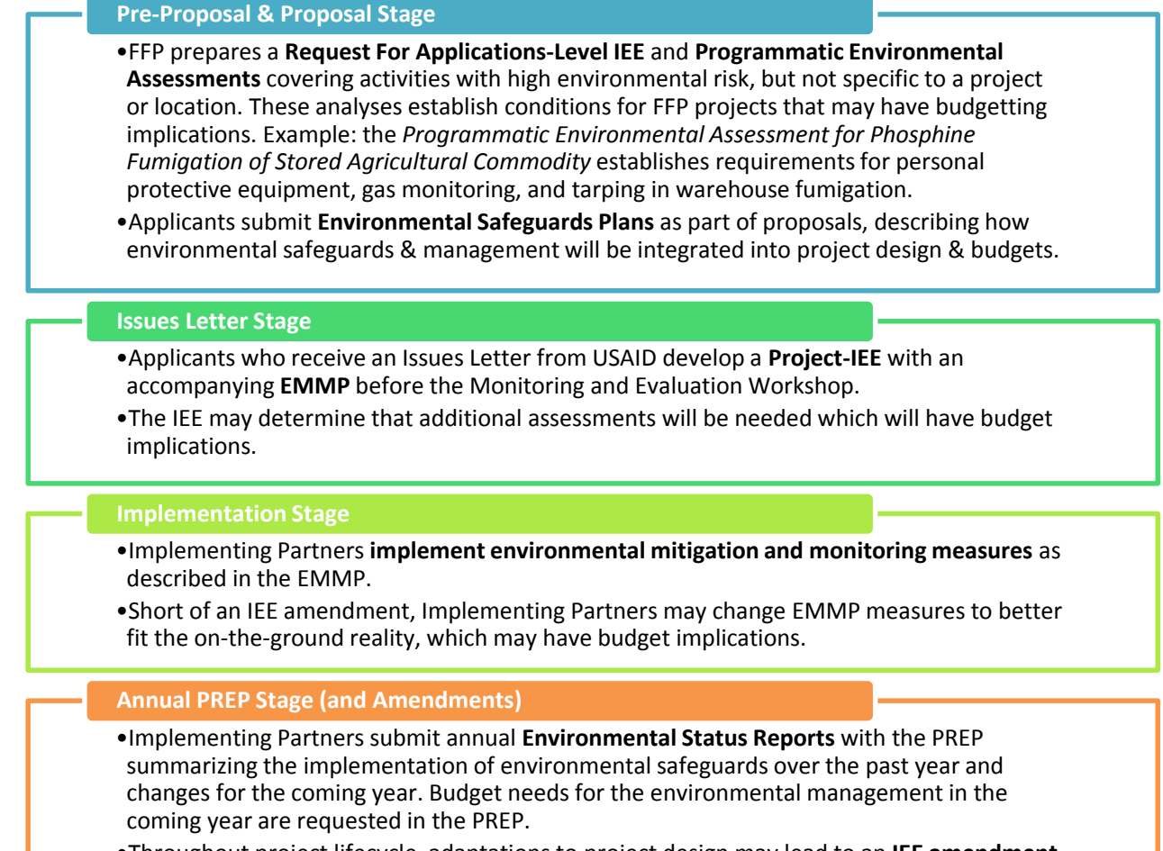
Figure 3. Integrating Environmental Compliance into FFP Life of Project

•Throughout project lifecycle, adaptations to project design may lead to an IEE amendment , which may have budget implications in the PREP.