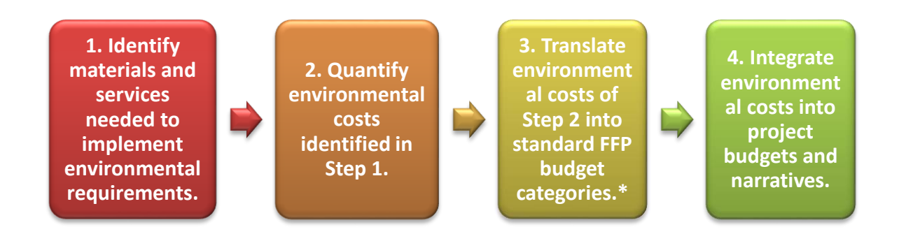
Figure 1. Developing Project Budgets for Environmental Compliance Requirements

*Note: It may be possible to combine Steps 3 and 4 into a single step, depending on the particular budgeting process. It is shown here as two separate steps for greatest clarity.