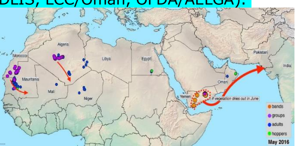
SGR - Eastern Outbreak Region: No locusts were reported in the Eastern Outbreak Region (EOR) during May (DPPOS/India, FAO-DLIS).

remain vigilant and launch preventive interventions as early as needed and possible (DLCO-EA, DLMCC/Yemen, FAO-DLIS, LCC/Oman, OFDA/AELGA).