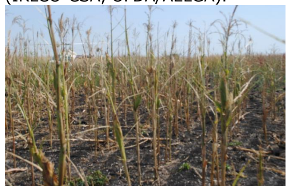
Damage caused to maize plants by NSE in Kafue Flats in Zambia (Source: IRLCO-CSA, May 2016).

concentrate and form dense groups and swarms. A joint survey in Malawi detected the presence of locusts in Chilwa/Lake Chiuta plains and Mpatsanioka Dambo, Locusts that were reported during April in Ikuu Plains and perhaps in Malagarasi Basin and North Rukwa plains in Tanzania are expected to have persisted through May. Infestations in Malawi and Zambia showed an increase over those of previous years suggesting that conditions were favorable for the locusts to persist and further develop. Surveys were not conducted in other outbreak countries and the situation remain unclear (IRLCO-CSA, OFDA/AELGA).