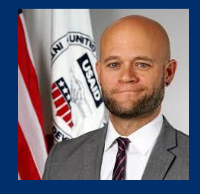
Director of the Office of Food for Peace Bureau for Democracy, Conflict and Humanitarian Assistance (DCHA)

Bureau for Resilience and Food Security (RFS)