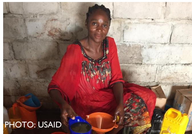
Photo: A Congolese refugee helps distribute rations of vegetable oil to her fellow beneficiaries during a food distribution in Lunda Norte.