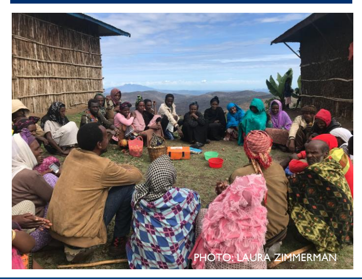
Photo: The Fedhi Jalela VESA, supported through FFP's PSNP partner World Vision, meets to discuss group savings and lending, literacy and business skill trainings, and market linkages.

Purpose 4: Strengthened ability of women, men, and communities to mitigate, adapt to, and recover from human-caused and natural shocks and stresses