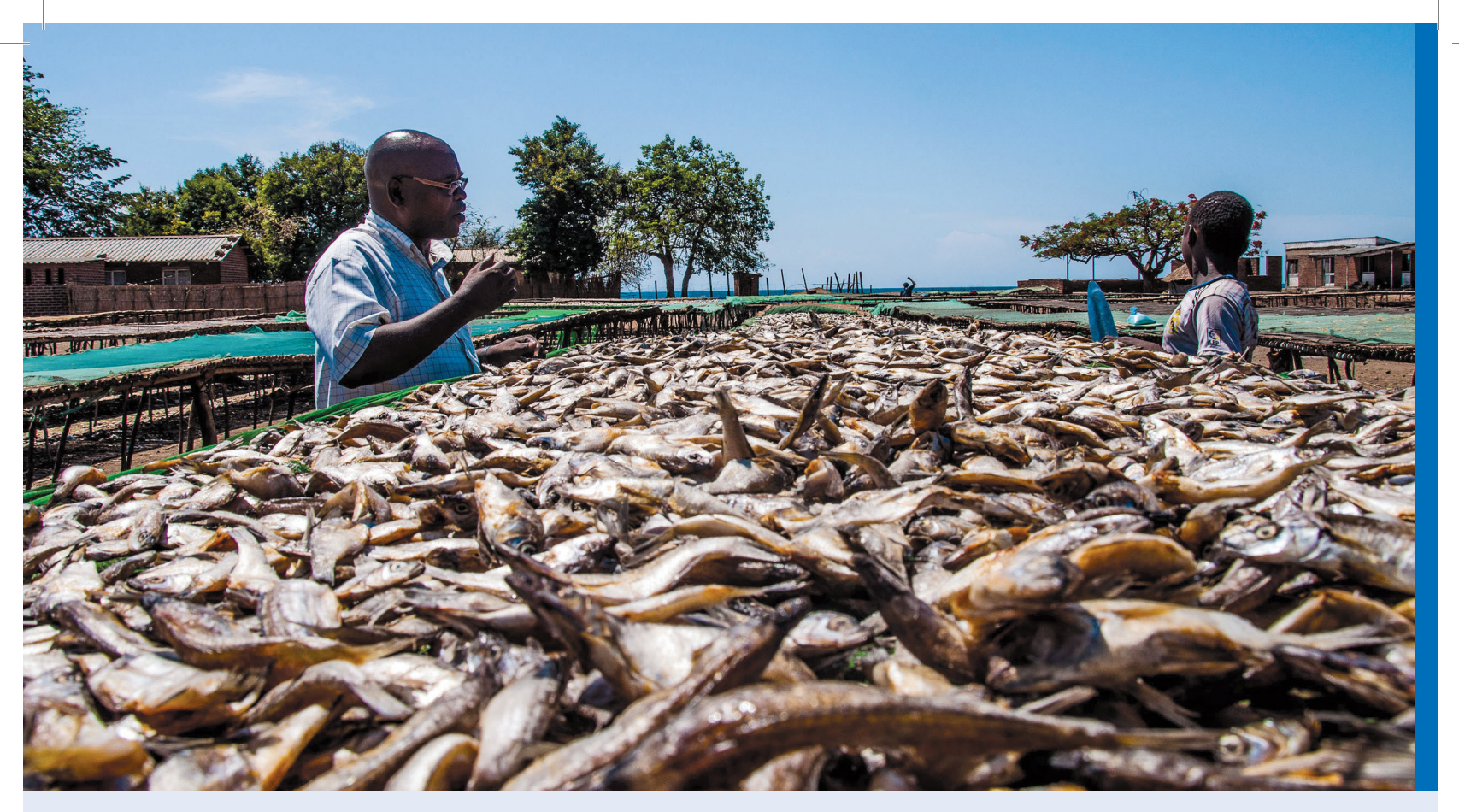
NEAR LAKE MALAWI, NOVEMBER 2015: Staff from USAID's fisheries conservation program advising local fishermen on how to reduce post-harvest losses.