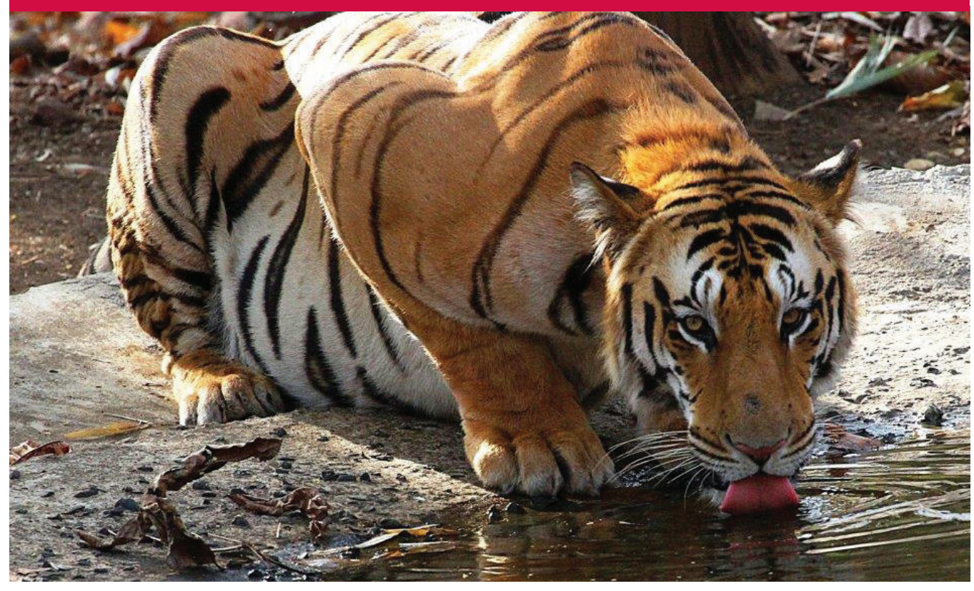
INDIA: Bengal tiger in the wild.