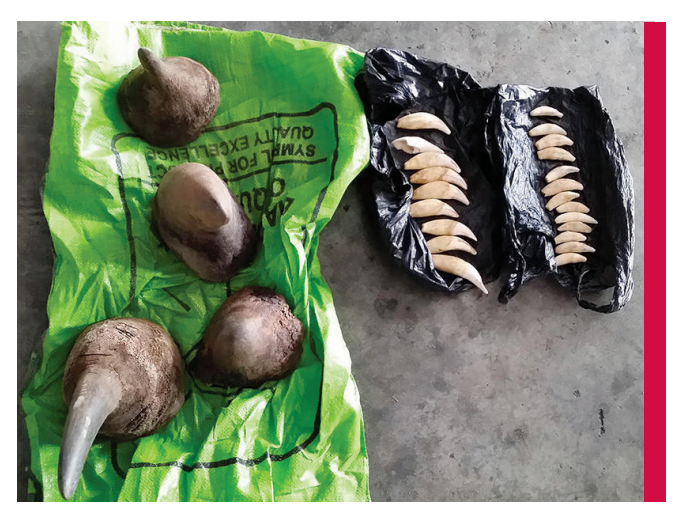
SINGAPORE, 2015: Rhino horns and tiger claws confiscated by authorities participating in Operation PAWS II, organized with assistance from Project Predator.

Conservation and habitat management are not enough to assure a future for wildlife threatened by demand for illegal wildlife products. A strong professional law enforcement response, with a clear focus on investigation of criminals and networks, is essential to ensuring the survival of endangered Asian wildlife species. INTERPOL's Project Predator, with the support of USAID, will continue to prioritize and facilitate efforts to dismantle transnational criminals and networks operating in Asia.