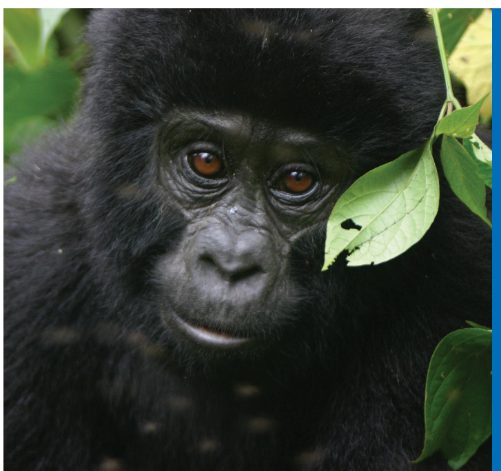
BWINDI IMPENETRABLE NATIONAL PARK, UGANDA, NOVEMBER 2004: Bwindi is home to nearly half of the world's gorilla population.