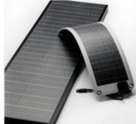
UNITED SOLAR SYSTEMS CORP

Amorphous silicon PV cells do not share the rigid structure of crystalline silicon but consist of a thin layer of silicon, typically coated on plastic or glass. This lack of structure at the molecular level hampers the flow of electrons, so the efficiency of amorphous silicon is less than that of crystalline silicon. Because the material is so thin, however, it can be layered with additional sheets of amorphous silicon or even crystalline silicon to achieve higher efficiencies.