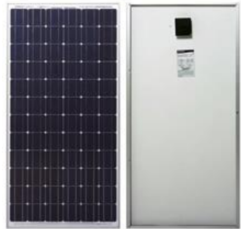
U.S. DEPARTMENT OF ENERGY

Crystalline silicon solar panels are typically rated at between 200 and 350 Wp. In order to produce more power, panels are connected to form an array. Using panels as a building block, a solar array can be sized to produce power for practically any application, from a 1 kW residential installation to a 100 MW grid-scale power plant. Correctly sizing a PV array involves a number of factors, including facility load, geographic location, panel size and rating, cost, space, and grid availability, among other considerations. PV system sizing is more thoroughly discussed in the sizing section.