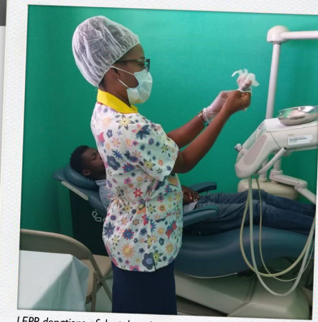
LEPP donations of dental equipment were transferred through partner organization Food for the Poor, Inc. to a clinic in the rural community of Onaville in Haiti. The clinic provides dental care and treatment at affordable rates — for example, charging approximately $1.60 for a consultation.

Furthermore, tents, generators and portable medical equipment acquired through LEPP and its partner organization World Help are utilized to provide mobile healthcare and offer flexible options for reaching vulnerable communities in rural areas in Nigeria and Uganda. Similarly, dental equipment were transfered by Food for the Poor, Inc. to a mobile clinic in rural Haiti. Instead of facing the daunting journey of traveling for hours for medical treatment, people in these rural communities now have local access to mobile health centers and dialysis clinics.