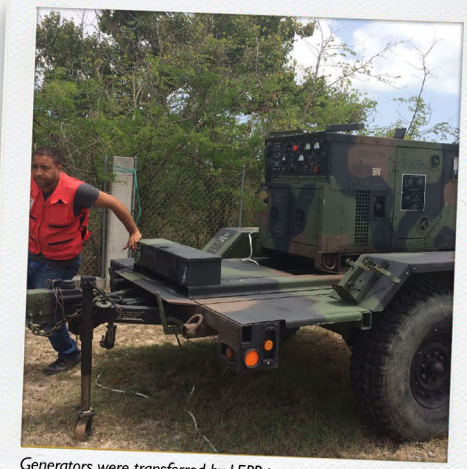
Generators were transferred by LEPP partner organization ART and donated to the Red Cross in Barbuda to aid in the emergency aid and relief efforts.