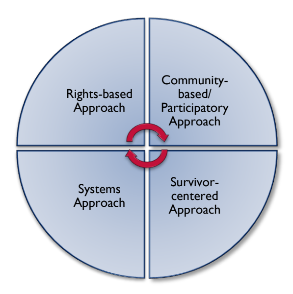
Figure 1-2. Core Approaches to GBV Programming and M&E