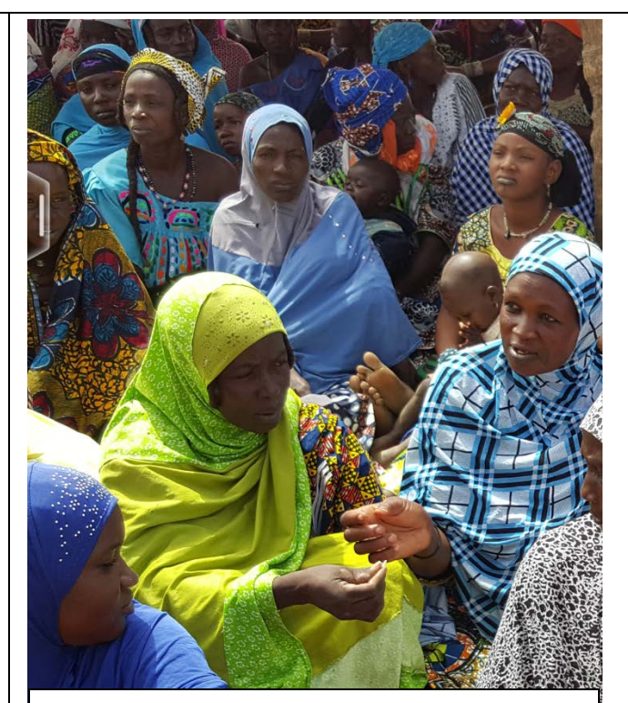
Women in Chileda waiting for FP services provided through a MSI mobile clinic.