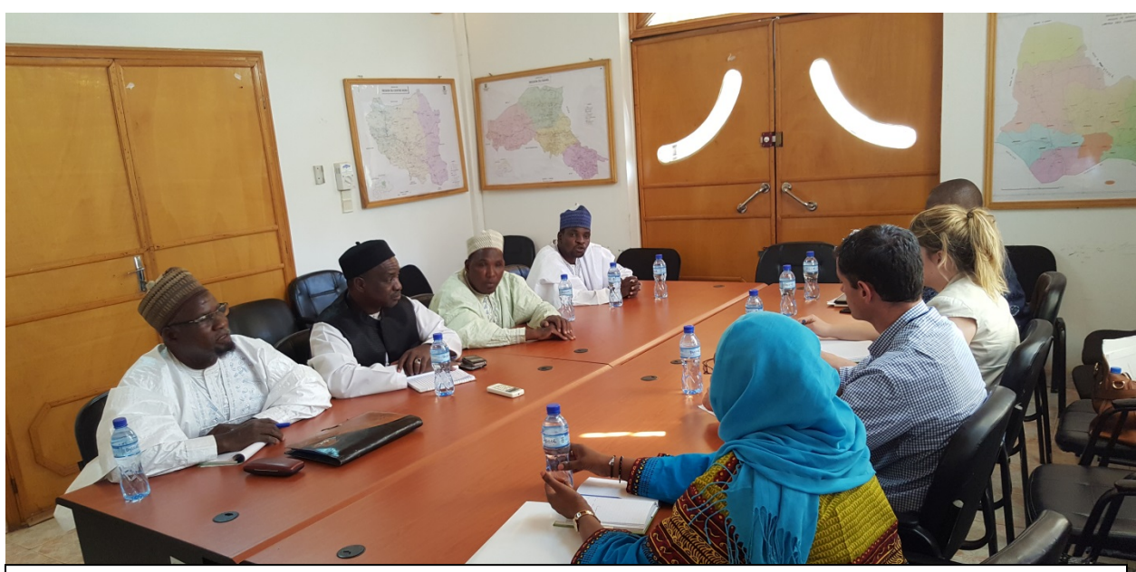
The FP Assessment Team discusses fertility with Islamic leaders in Niamey, Niger.

Following the collection of primary and secondary data in each country, the FP assessment team conducted a thorough analysis of strengths, weaknesses, opportunities and threats related to increasing the use of FP service in the RISE zone. The FP assessment team in consultation with local USAID health staff then identified potential programming options to better leverage existing FP and resilience