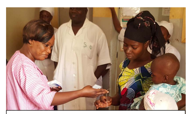
Health worker at Bulkuy CSPS showing a woman an IUD

these services are subsidized, the modest cost is still a barrier to access as shown by the very high turnout at Special Days, when FP services are free. Challenges within the overall health system (e.g., quality and quantity of clinical staff in rural areas) continue to pose barriers to FP use. The Government of Burkina Faso (GoBF) has a 500M CFA line item for family planning commodities, although actual expenditure is usually far less (projected at 160M in 2016).