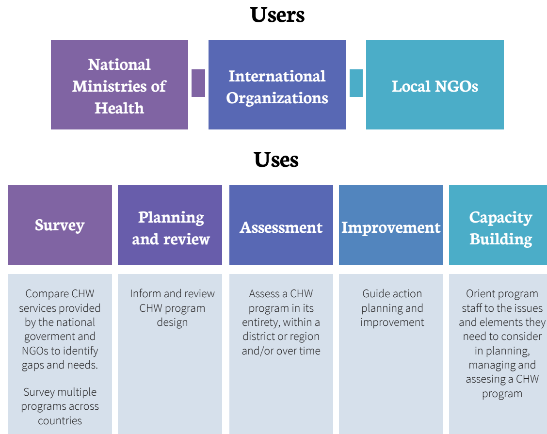
Figure 1: adapted from CHW AIM, 2013 edition [13]

Since 2011, investment in CHW-led health delivery has continued to grow and the body of evidence related to CHW effectiveness has also expanded considerably. Therefore, this update of the CHW AIM Functionality Matrix was undertaken to incorporate current evidence on CHW program efficacy and effectiveness [14-19], the latest syntheses of practitioner expertise [20-22], and to improve the usability of the tool. This updated version of the CHW AIM Functionality Matrix is intended to complement the 2018 WHO guideline on health policy and system support to optimize community-based health worker programmes and integrate with existing domain-specific tools for optimizing CHW programs (e.g. UNICEF/MSH’s Community Health Planning and Costing Tool). [23, 24, 25] As with the original AIM tool, this updated version is intended to capacitate the processes of programmatic design, planning, assessment, and improvement, for stakeholders ranging from local NGOs, to national policymakers and planners, to global stakeholders (Figure 1).