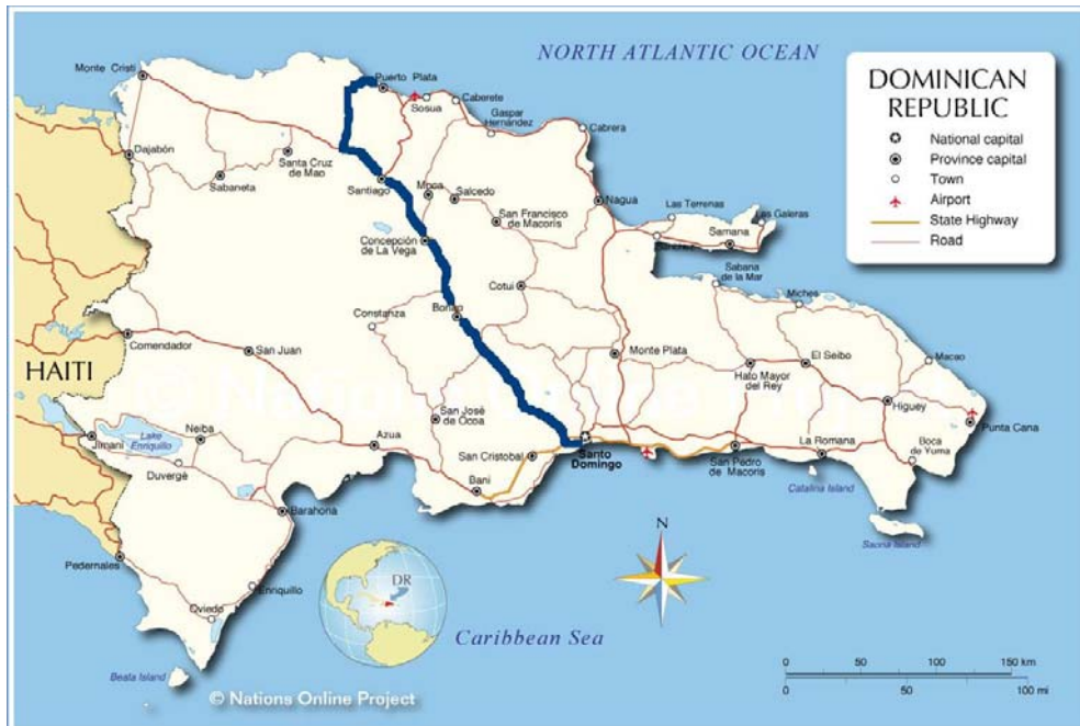
Bold line traces corridor

While most DO1 and 2 resources will be concentrated in this geographic area, it will not be exclusive. In certain cases, such as working in coastal cities on global climate change, some activities will be funded outside of this geographic area. For HIV/AIDS (DO3) the location of key populations will guide where HIV/AIDS investments and services are offered. As mentioned above, some of these key populations (at-risk youth and drug users) may be concentrated in this same urban corridor, but other key populations (people crossing the border and sex workers in tourist areas) are not. Therefore, while DO3 will have significant overlap with DOs 1 and 2 along the Santo Domingo-Puerto Plata corridor, DO3 will not be geographically concentrated.