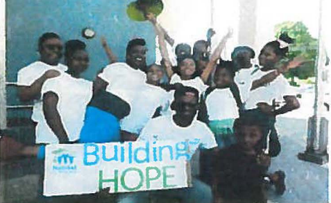
Changing lives and building hope