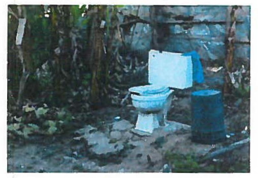
Inadequate sanitation facilities and waste disposal