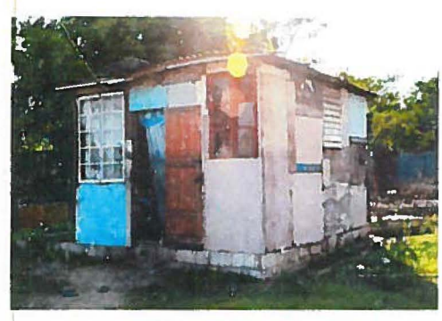
Houses built with unsafe materials and not up to code