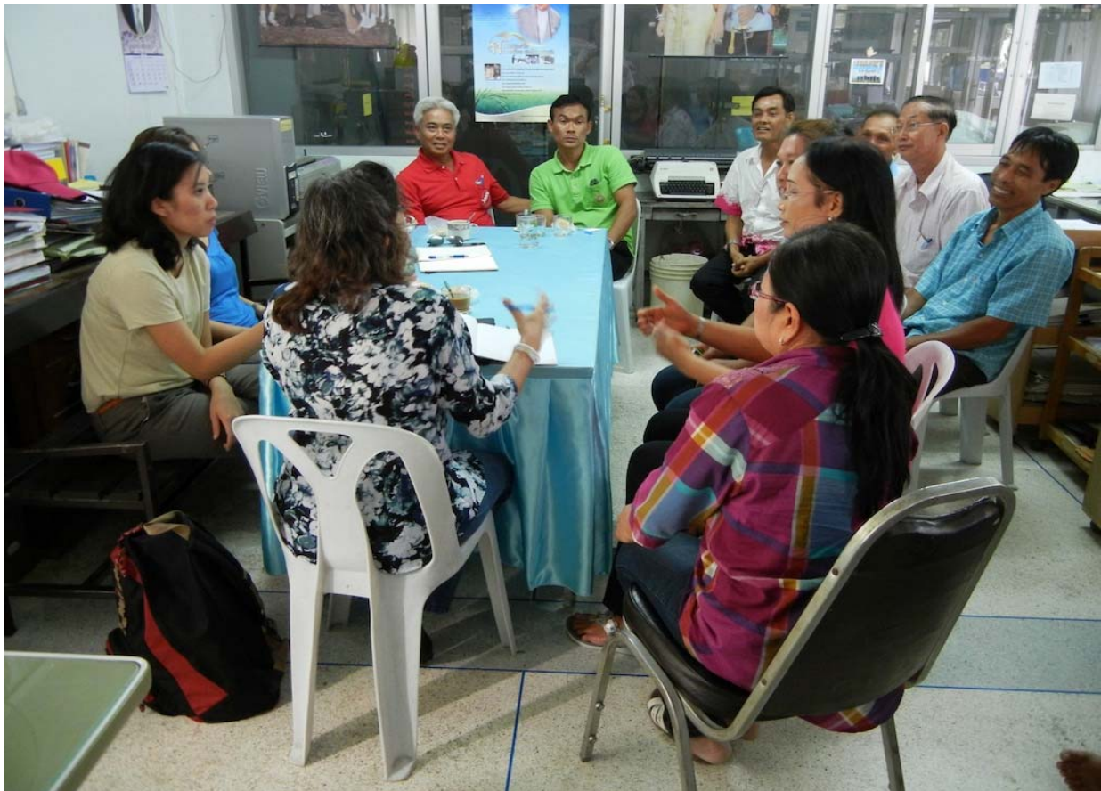
Members of a Thai growers cooperative meet to discuss constraints.

When producers, processors, and traders assume the various aspects of enterprise formality, their businesses can grow and their goods can circulate more freely, within and across borders, enhancing food security.