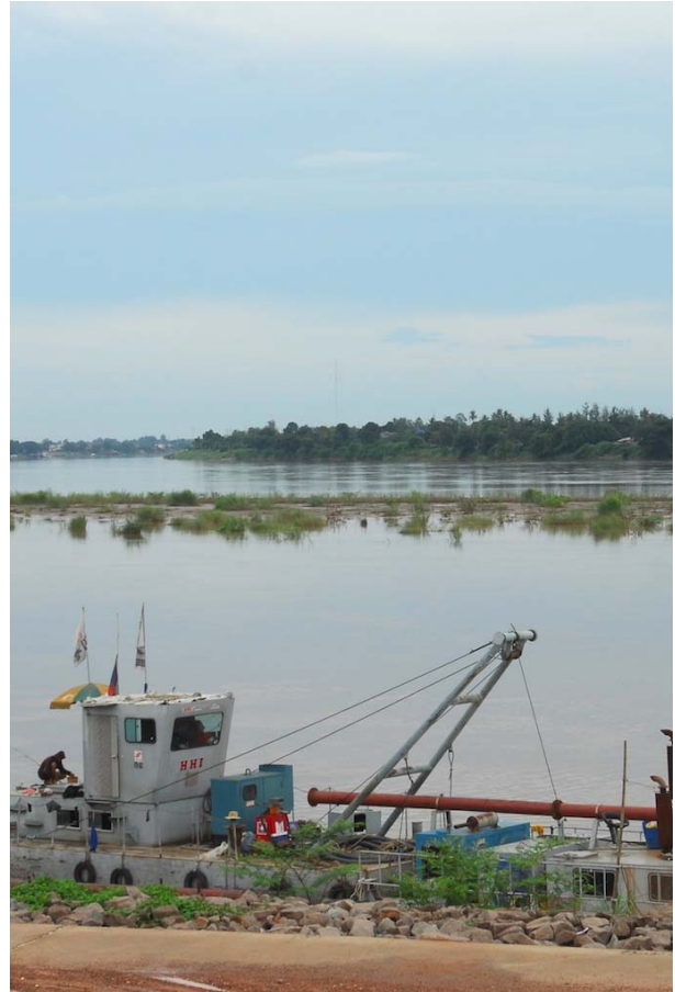
Forming much of Thailand's border with Laos, the Mekong River is critical to Thailand's infrastructure and food security.

Historically, corruption and mismanagement of public finances have been associated with Thailand's infrastructure projects. The Thaksin government (2001-2006) was often accused of handing out undeserved concessions to parties favored by or beneficial to the government. Critics in the media and private sector charge that the government continues to allocate project budgets at rates higher than actual costs, with the difference collected by officials at various levels. According to the World Bank, Thailand has put in place systems that help identify