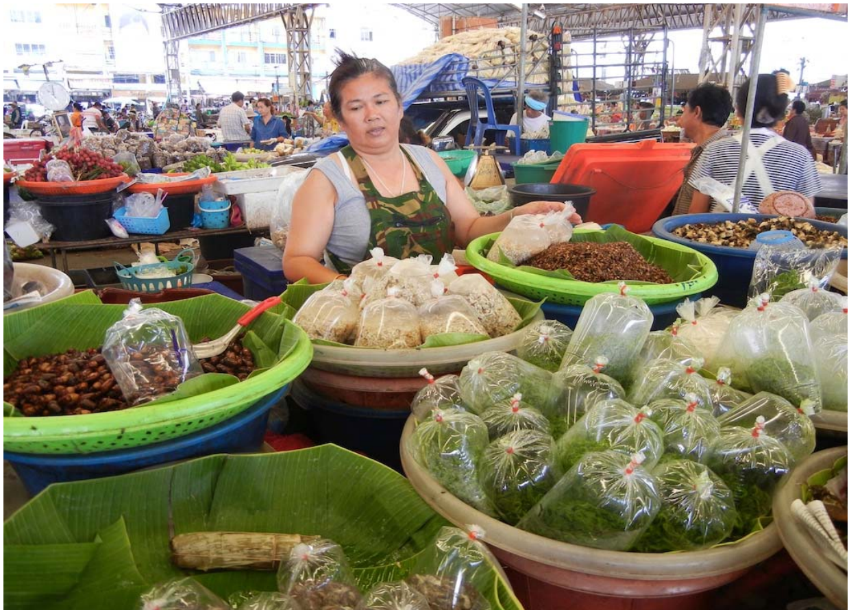
Access to finance remains a challenge to small business.

Through the Bank of Agriculture and Agricultural Cooperatives (BAAC), Thailand's government promotes access to finance in rural areas, giving farmers access to credit without being subject to cumbersome procedures. BAAC has different scales of lending in keeping with customers' income,