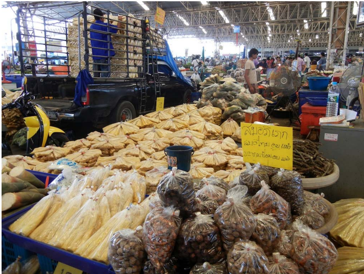
Thai agricultural products are known for their high quality standards.

Markets function more efficiently when trade is managed through transparent tariffs and legitimate health and safety measures, rather than via more opaque quotas, licenses, and other barriers.