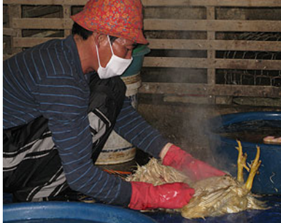
USAID and its partners promote greater awareness of avian influenza among poultry workers in Vietnam