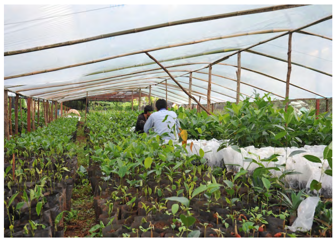
Agriculture, even simple greenhouses, often cannot be modernized without financing.

markets, including through the harmonization of Member State laws pertaining to capital markets; and strengthened cooperation among Member States' insurance markets.<sup>12</sup>