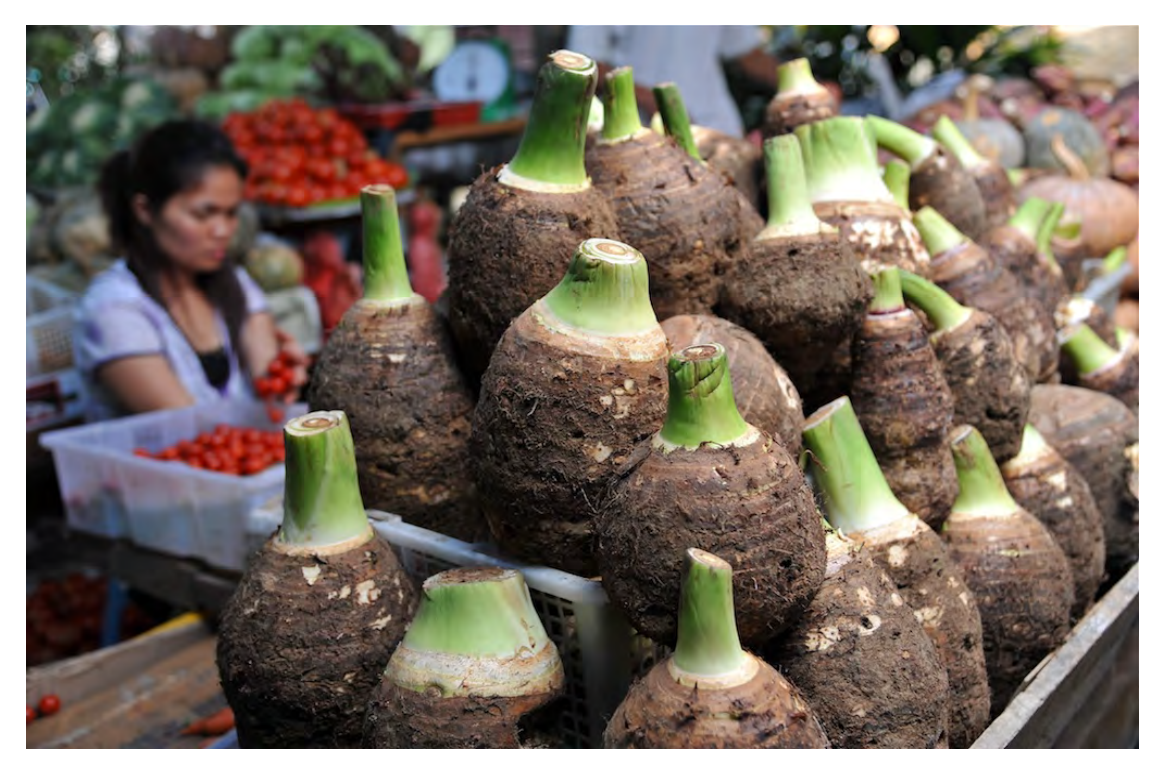
Market traders are often heavily burdened by usurious interest rates.

lending. Amanah Ikhtiar Malaysia (AIM) is the dominant provider of traditional microfinance, offering Grameen-style, interest-free loans to poor borrowers for the purpose of income generation.