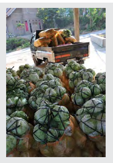
What is collateral?

As a starting point for strengthening the environment for credit, countries need a strong legal and regulatory framework for lending.<sup>2</sup> Essential components of the framework include not only general laws governing the establishment and supervision of banks and other lending institutions, but also a real property law and a secured transactions law that allow the use of "real property" (land and buildings affixed to the land) or "movable property" (goods and equipment that can be moved) or even "intangible property" (accounts receivable, government bonds, corporate shares, intellectual property) as collateral to secure loans. Collateral lending lowers the risk of default because borrowers will normally pay off their loans rather than risk losing the property used as collateral. A well-structured secured transactions law expansively defines the property that can be used as collateral, and thus expands access to credit. In modern systems, collateral ranges from tangible property, such as tractors and processing equipment, to intangible property such as future crops or long-term contracts. Livestock and inventory can also serve as collateral, even though the individual items may change over time.<sup>3</sup>