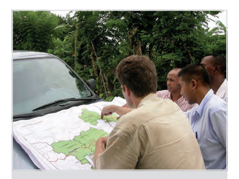
Protected areas under the new SAPM system will be zoned into various categories, approximately half of which will involve some degree of co-management with either local communities or private operators. Some KoloAla (production forest sites) will be within the protected areas, while others may be defined outside the protected area system.

There are several management options available under the 2006 Forest Code, which allows for public-private partnership: (1) long-term contracts with the private sector under careful monitoring to ensure respect of management guidelines, (2) management by community groups (COBAs), and (3) government-managed