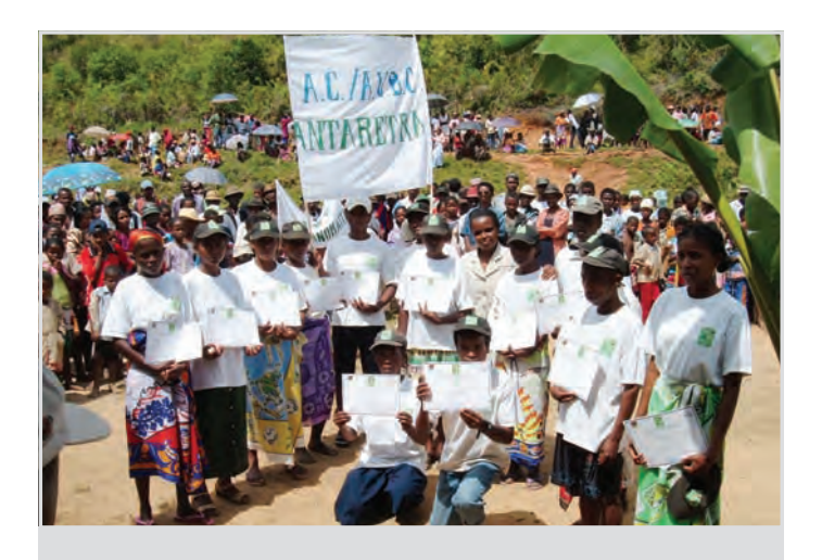
The Commune Mendrika (Progressive Communes) program rewarded communities that made significant progress toward environment, heath, governance, and economic goals.

The Ravalomanana deconcentration of power translated into a massive national effort to dominate and control not only the 1,392 communes, but also the even smaller fokontany. This was particularly insidious in so far as it extended the reach of the predatory state to this previously relatively functional level of local government.