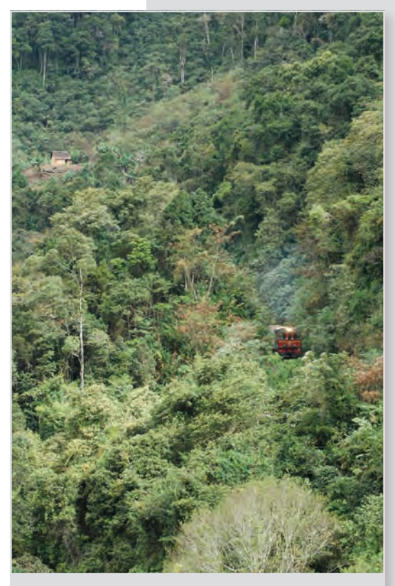
Saving the Fianarantsoa forest corridor depends in large measure on saving this train line that traverses the corridor. The FCE railway debacle sadly illustrates how bad governance can sabotage economic and environmental progress.

The issues raised here are by no means unique to Madagascar; though Madagascar's governance problems are profound and persistent. The fact that other countries face similar issues is not much consolation, however, unless we can show that those countries have made rapid and significant progress on economic and environment indicators in spite of governance weakness. In Madagascar, we are left with the question of whether progress on environmental issues can take place in the context of a State which may not want to be reformed and may not have a true commitment to sustainably managing its environment. At a minimum that conclusion would beg a change in the "benign state" approach employed by donors over the past quarter century.