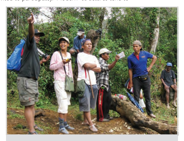
In this photo, COBA members monitor tavy activity at the forest edge. Enforcement of illicit activities within villages has proven difficult due to the need to maintain good social relations. The state rarely backs up COBA enforcement efforts.

The costs of management. Comparison of the costs of enforcing forest policies through DEF or through COBA mechanisms confirm that it is much less expensive to work through the COBAs. One recent set of estimates posited that it costs the COBAs about $.08 to control a hectare of territory as opposed to ANGAP's local cost of about $5-$8 per hectare to manage a small park (Hockley, 41). These co-management costs underestimate the other inputs needed to make this system sustainable and effective (notably the need to provide some external enforcement and the vulnerability of the co-management system when benefits are not sufficient to maintain community interest), but they are nonetheless telling. Given this advantage,