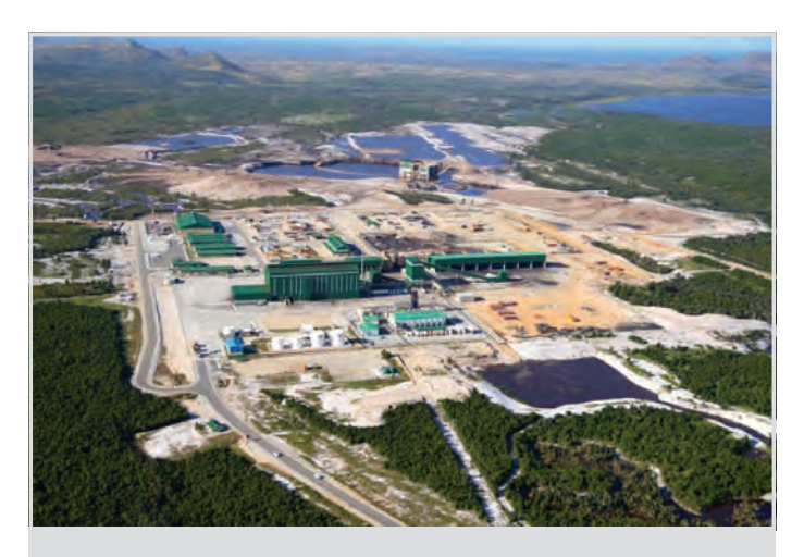
The arrival of multinational mining companies (here a photo of Rio Tinto's operations near Fort Dauphin) adds new challenges to environmental conservation in Madagascar.

Concern about the effects of climate change on Madagascar's biodiversity and livelihoods motivated the organization of the 2008 Climate Change workshop in Antananarivo. USAID and its partners (among them Cl and WWF) played a key role in helping the GoM to organize the workshop with MacArthur Foundation support. The U.S. Ambassador was a keynote speaker. More than 130 experts participated, some bringing experiences from Madagascar, while others used sophisticated models to predict the likely effects of climate change on different species and eco-systems.