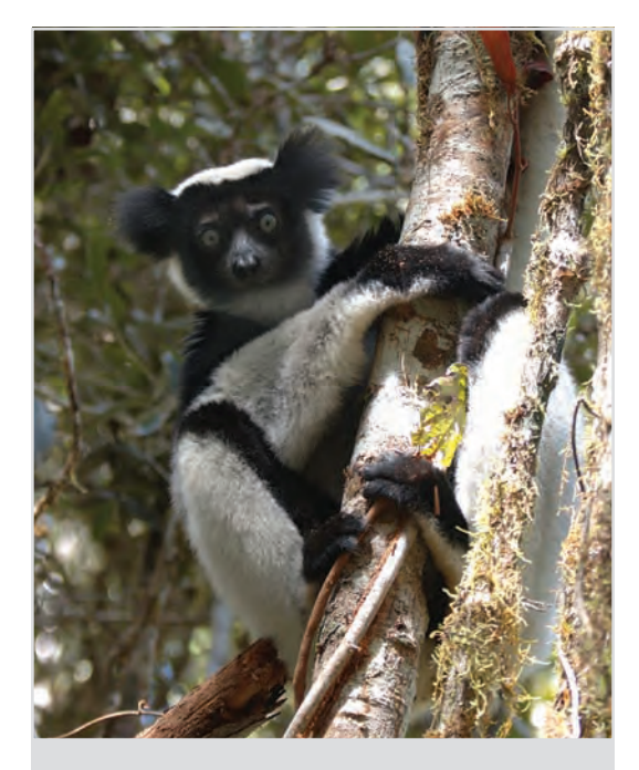
The Indri (or babakoto) lemur, with a remaining population of fewer than 10,000 and a rapidly diminishing habitat, may already be on the wrong side of its ecological tipping point. How much, collectively, do we care?

characteristic that must be highlighted is the divergence in the value the international community places on Madagascar's natural resources compared to that accorded by the Malagasy (whether the State or local communities). This difference is probably greater for Madagascar than for any other country in the world though specific sites elsewhere may have similar challenges. The international community places an extremely high value on Madagascar's biodiversity because it is unique; it is found nowhere else on earth. If we fail to protect the resources in Madagascar, we can't count on a neighboring country to perhaps do better. Furthermore, to meet the biodiversity