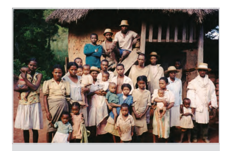
Many of Madagascar's rural people, as this family who farms next to Andringitra Park, depend on natural resources for their livelihoods. Difficult as it may be, it is imperative that future interventions do even better at incorporating local voices and social justice issues into our treatment of biodiversity issues in Madagascar.

All actors in the next phase of environmental planning should incorporate significant changes in the international context into their analyses. If Madagascar's environmental profile has risen over the past 25 years, so has interest in its mineral and petroleum riches. Influencing these giant national and multinational industries will require different strategies from those employed in previous environmental programs.