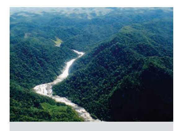
From EP I to EP II, the emphasis shifted from the integrated conservation and development (ICDP) approach to protecting much vaster corridors linking national parks. (Here: the corridor between Ranomafana and Andringitra parks.)

To get from the general principles of the NEAP to operational programs, in 1988 the World Bank formed a series of working groups that mobilized about 150 Malagasy from government, academia, and civil society alongside about 40 international environment experts (many of whom are still involved today). The working group proposals were then approved by the National Assembly. The grand plan for implementing the NEAP was divided into three successive Environmental Programs: