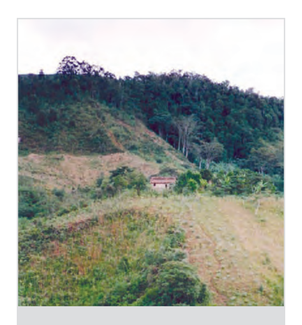
Tavy remains the principal cause of humid forest destruction as forest reserves are transferred into agricultural production zones; this photo from Ambodigavy in the Zahamena forest corridor c. 1998.

As the primary proximate cause of forest conversion in many of the priority biodiversity zones (nationwide estimates suggest that 80-95% of deforestation is caused by agricultural conversion, while the remainder is caused by extraction of wood for fuel or building materials), the PE II and PE III eco-regional projects put enormous effort into persuading farmers to forego the extensive slash-and-burn agricultural production system. While these production systems were sustainable in the past, when the population was small, fertile land was abundant, and I5-year fallows allowed soil fertility to regenerate before land was put back into production, these conditions no longer exist in Madagascar. With fallows that rarely exceed three years, there is rapid deterioration of soil fertility and many lands are more or less abandoned for agriculture after 20-30 years (which equates with fewer than I0 harvests).