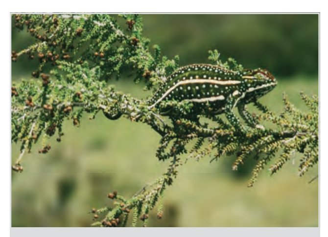
Madagascar's biodiversity is unique: 98% of its mammals, 91% of its reptiles, and 80% of its flowering plants are found nowhere else on earth.

Concerted efforts<sup>2</sup> to save Madagascar's natural forests<sup>3</sup> began in the mid 1980s when Madagascar and its partners began preparing the first Madagascar National Environmental Action Plan (NEAP).