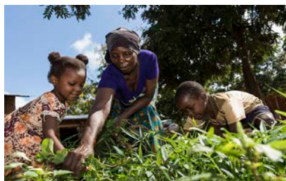
Feed the Future integrates women into agricultural value chains and ensures all household members benefit from expanded economic activities in Tanzania.