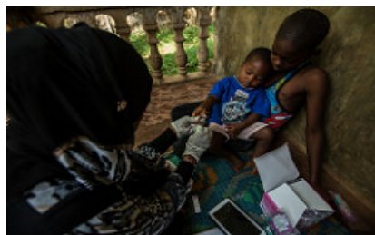
The President's Malaria Initiative works with the Zanzibar Malaria Elimination Program to sustain gains in malaria control.

Education: USAID's education activities in Tanzania aim to improve early grade learning for 1.4 million primary school children by increasing the availability and use of quality learning materials, improving teacher skills and behaviors, and enhancing parental and community support in over 3,000 primary schools. These activities are complemented by reading and math assessments every other year to track gains in learning and guide future strategy, policies, and programs. USAID also partners with local government authorities, school and community leaders, teachers, and parents to provide interventions that increase adolescent girls' enrollment and retention in secondary school.