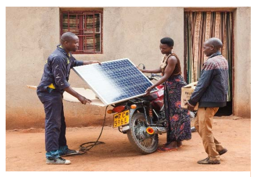
With partners like Mobisol, PAOP helps bring off-grid power solutions, such as SHS, to families.

Expanding Cross-Sectoral Integration. To support the growth of cross-sectoral energy projects in Rwanda, PAOP is collaborating with USAID and other donor programs in sectors such as agriculture, health, water, and education. In addition, PAOP is engaging private sector