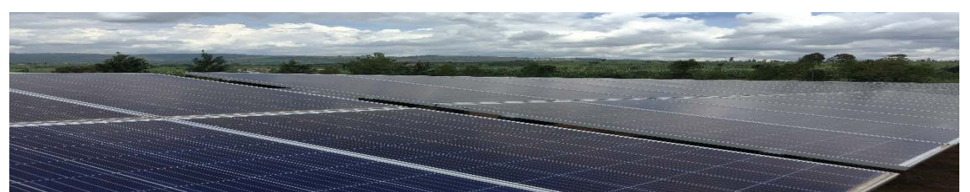
A field of solar panels provided by Absolute Energy, a PAOP partner, helps to power a rural community in Rwanda.

The USAID-funded Power Africa Off-grid Project (PAOP) provides technical assistance and targeted grant funding to support the development of Africa's off-grid SHS and mini-grid sectors. Through a team of resident technical advisors across East and West Africa, PAOP works with companies, investors, and governments to advance the role of the private sector in extending energy access while integrating gender considerations into all its work streams.