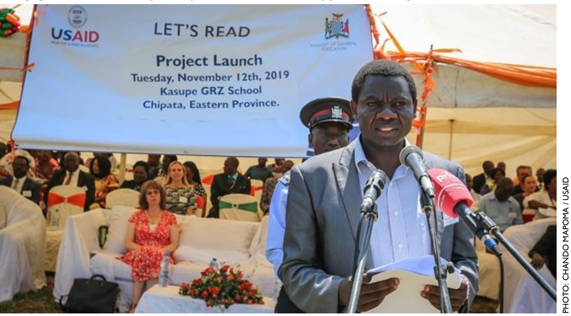
Photo: Honorable David Mabumba, the Government of the Republic of Zambia Minister of General Education, delivering the keynote address during the national launch of USAID Let's Read Program's at Kasupe Primary School in Eastern Province.