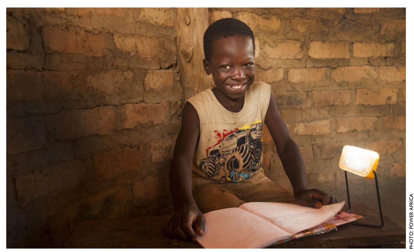
Photo: USAID/Power Africa supported home solar lights help provide light for students as they study at night time and protect families from costly, dangerous lighting alternatives like candles and paraffin. Power Africa is bringing together technical and legal experts, the private sector, and governments from around the world to work in partnership to increase the number of people with access to power.