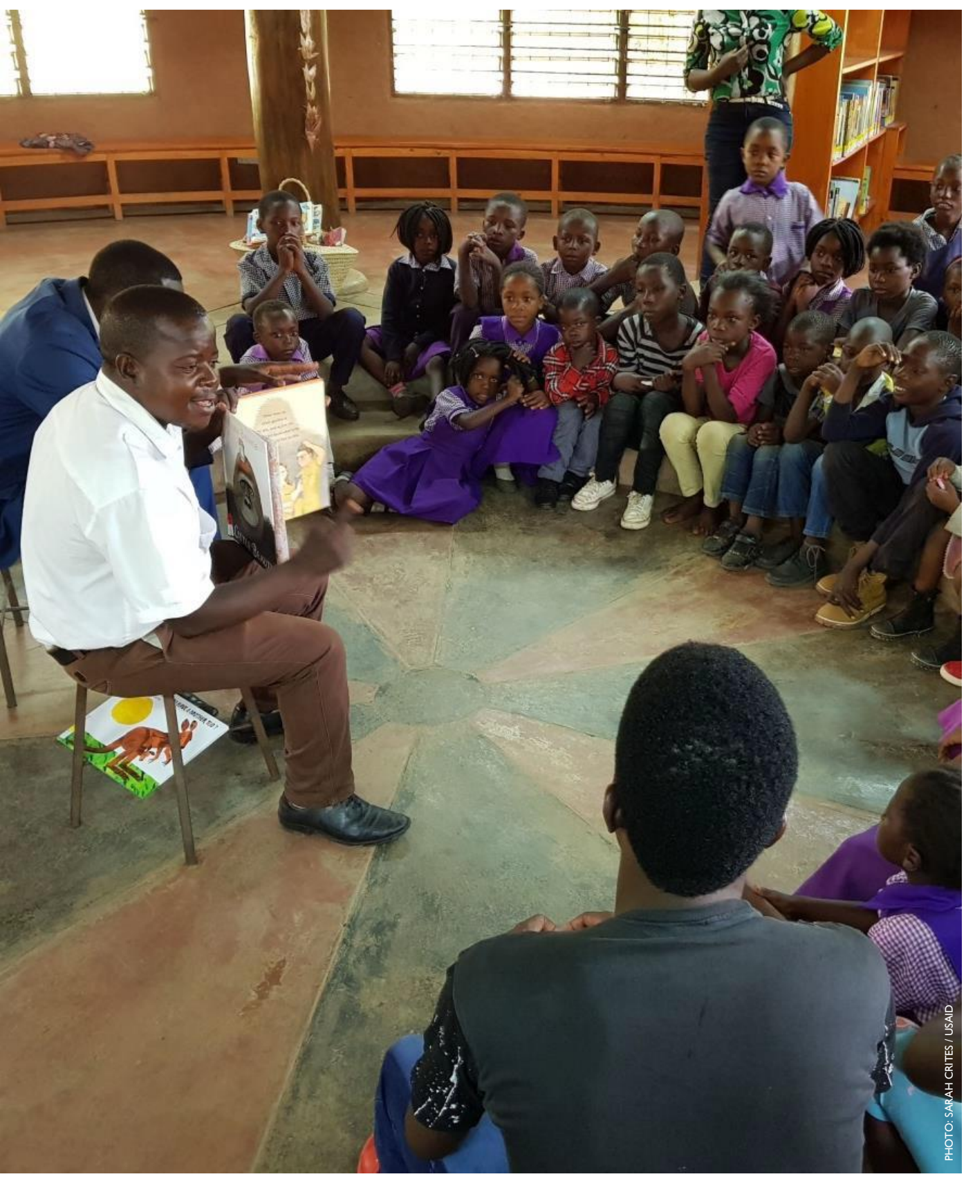
Photo: Students gather around their teacher while visiting the Lubuto Library in Mthunzi Center, Lusaka. Supported by USAID's Office of American Schools and Hospitals Abroad, Lubuto Library Partners builds the capacity of public libraries to create opportunities for equitable education and poverty reduction, and increases access to quality education for marginalized and out-of-school children.