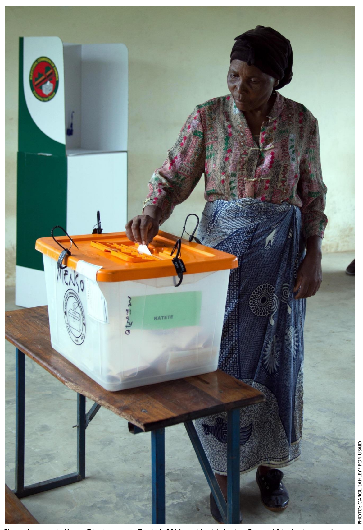
Photo: A woman in Katete District votes in Zambia's 2016 presidential election. Free and fair elections are the cornerstone of a true democracy, and USAID's Democracy, Human Rights, and Governance Program supports elections free of corruption, intimidation, and violence.