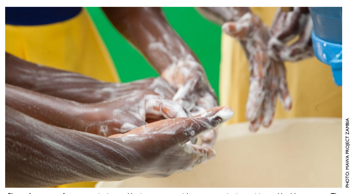
Photo: Access to safe water, sanitation, and hygiene are essential to protect gains in nutrition and health outcomes. The two-year Mawa project works to address water and sanitation needs of the most vulnerable Zambians to reduce the spread of pathogens and illness.

USAID SUN TA will provide technical support for the development of Zambian District Nutrition Coordinating Committee and Provincial Nutrition Coordination Committee work plans, identifying assets, addressing challenges, and providing technical support to create sustainable, replicable systems across nutrition-specific and nutrition-sensitive programming. In areas where there is limited technical expertise at the district level and below, the USAID SUN TA activity will provide more intensive technical assistance. It will work hand-in-hand with Zambian government officials on joint work planning, prioritization, budgeting, activity implementation, progress reporting, and monitoring.