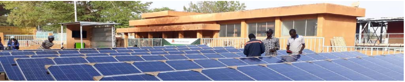
A solar farm in Niger gives local communities access to power.

The USAID-funded Power Africa Off-grid Project (PAOP) provides technical assistance and targeted grant funding to support the development of Africa's off-grid SHS and mini-grid sectors. Through a team of resident technical advisors across East and West Africa, PAOP works with companies, investors, and governments to advance the role of the private sector in extending energy access while integrating gender considerations into all its work streams.