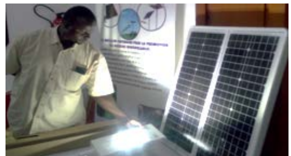
A consumer in Niger inspects a solar panel as a result of PAOP’s mission to bring sustainable off-grid power solutions to underserved communities.

Expanding Cross-Sectoral Integration. To support the