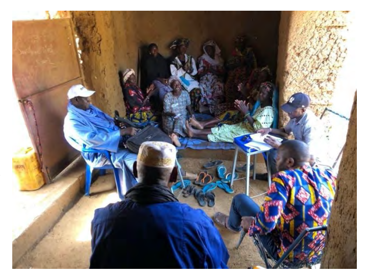
Photo I: Focus group with a women's producer organization in Koro.

The evaluation team received a list of villages where SVPPs/Veterinary Auxiliaries (VAs) and Farmer Field Schools (FFSs) were co-located. From that list, the team chose seven colocated villages in the Bankass and Koro circles. These are: Koro Center, Tere, Koporona, Pel-Maoude, Ende Toro, Logon, and Tori. For contrast, the team next chose seven non co-located villages within the Mopti and Timbuktu regions where FFSs existed, but there was no SVPP/VA service. These are Mopti/Bandiagara circle (Dandoli), Mopti/Mopti circle (Gnimitongo), Mopti/Djenné circle (Sofara). Within the Timbuktu region the evaluation team chose Diré circle (Bourem Sidi Amar and Tindirma), Goundam circle (Tonka), and Niafunké circle (Sibonne). Since five villages had two FGDs each, the number of FGDs for co-located