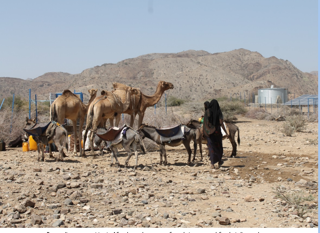
Pastoralist communities in Afar depend on water for subsistence and for their livestock to counter extreme heat and increasing drought

Pioneering a Systematic Approach to Better Operate and Maintain Rural Water Schemes in Ethiopia's Remote Afar Region