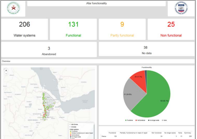
Left: SweetSense sensors placed near a rehabilitated borehole to detect functionality and water flow. Right: The Afar region customized web-based platform that provides real time functionality monitoring for the RWB and WWOs, allowing for better decision-making at the regional level

Collaborating with SweetSense (www.sweetsensors.com), USAID Lowland WASH Activity supports the RWB and WWOs to identify and tag each borehole and place remote sensors to characterize borehole pump operations and water flow. These sensors gauge the electrical power to the pump and generate daily information on pump functionality and operational duration. Combined with additional information on water scheme users, the RWB and WWOs can estimate service levels such as the maximum average water produced, or pumped per day.