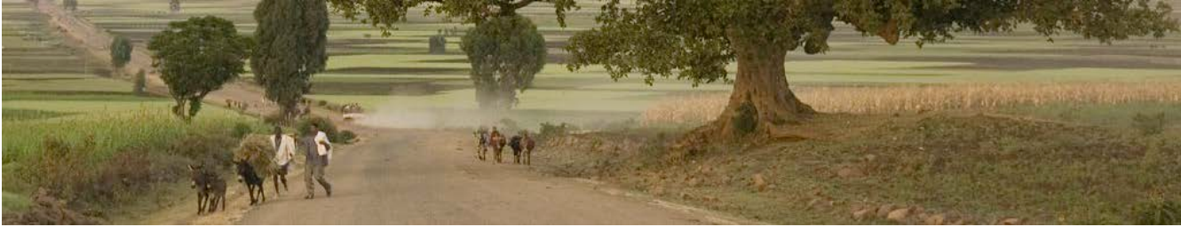
PAOP serves Ethiopian rural communities with limited access to power.

The USAID-funded Power Africa Off-grid Project (PAOP) provides technical assistance and targeted grant funding to support the development of Africa's off-grid SHS and mini-grid sectors. Through a team of resident technical advisors across East and West Africa, PAOP works with companies, investors, and governments to advance the role of the private sector in extending energy access while integrating gender considerations into all its work streams.