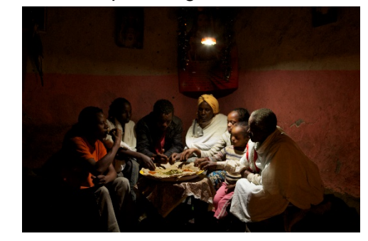
A solar lamp lights a family's meal in Addis Ababa, Ethiopia.

Expanding Cross-Sectoral Integration. To support the growth of energy-agriculture projects and products in Ethiopia, PAOP focuses on helping off-grid companies develop productive use applications of their products and collaborating with relevant USAID projects and partners.