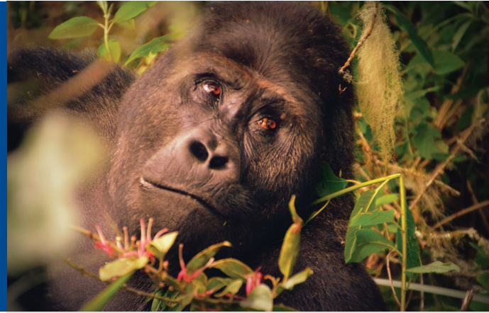
DEMOCRATIC REPUBLIC OF THE CONGO – 2015: USAID support for rangers in Kahuzi-Biega National Park helps protect populations of critically endangered Grauer's gorillas.