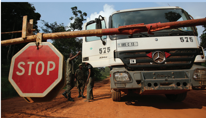
DEMOCRATIC REPUBLIC OF THE CONGO – 2012: Eco-guards check a logging truck in the Nouabalé-Ndoki National Park buffer zone.