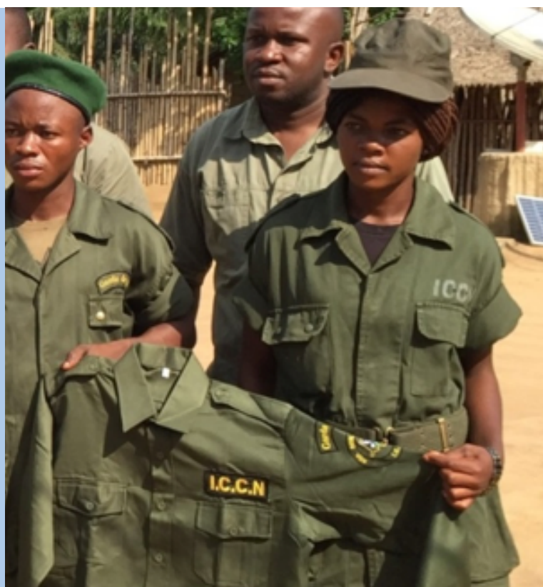
DEMOCRATIC REPUBLIC OF THE CONGO – 2014: Eco-guards receive equipment in Maringa-Lopori-Wamba Landscape.