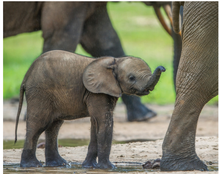
REPUBLIC OF CONGO – 2004: Forest elephant populations in the Sangha Tri-National Landscape are growing with the help of USAID's conservation efforts.