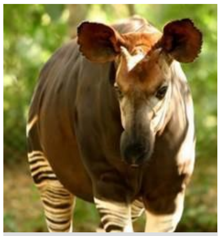
DEMOCRATIC REPUBLIC OFTHE CONGO: The rare okapi is protected in Okapi Wildlife Reserve situated in the Ituri-Epulu-Aru Landscape.

www.usaid.gov/central-africa-regional cod.forest-atlas.org CARPEManagement@usaid.gov